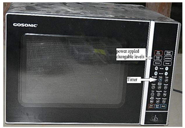
Fig. 3. Microwave device used in this study