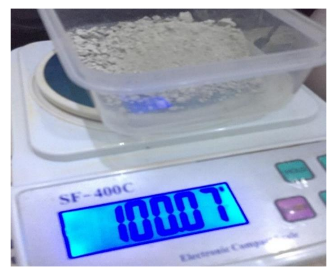
Fig. 2. Weight of prepared sample of drill cuttings