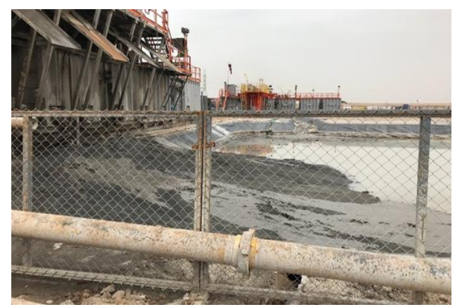
Fig. 1. Drill cutting of South Al-Rumaila oilfield pits

Then, pure samples were taken from the drill cuttings and fixed at (100 gm weight) and crushed to have a size of grain (5-10 mm) for each sample as shown in Fig. 2.