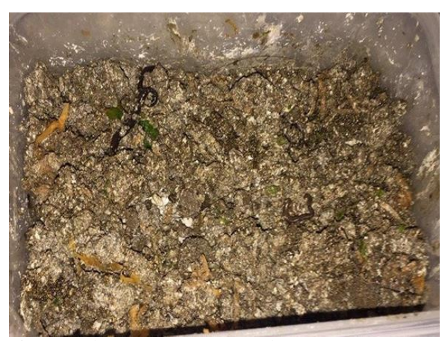
Fig. 4. Earthworms treatment sample

The treated drill cuttings, with 1.41% w/w in mass were prepared by adding (50% w/w in mass) of fertile soil that came from the same source of the obtained earthworms. Neutron food (Carrots, Cabbage, and waste of slaughterhouse) was added by (20% w/w in mass) to the total weight, taking into account the addition of fertilizer as a ratio (25:1) of Nitrogen to phosphor to each sample [26] as is shown in Fig. 4 .