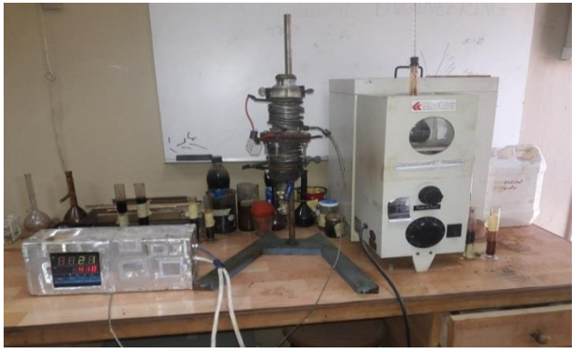
Fig. 1. Laboratory batch reactor devices

After completion of calcination, the temperature of the reactor lowered and the extraction of coke is begun.