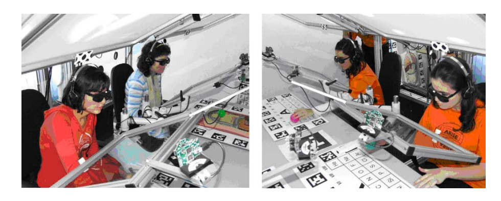
Figure 1: Students testing the ARTP learning scenarios: Biology (left) and Chemistry (right)

ARTP is a "seated" AR environment: users are looking to a see-through screen where virtual images are superimposed over the perceived image of a real object placed on the table [27]. Two AR-based applications were developed onto this platform (see Figure 1).