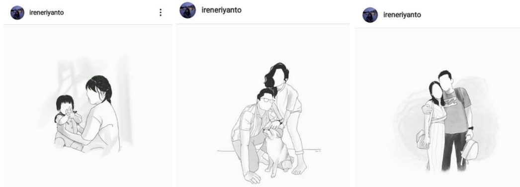
Figure 2. Custom illustration from Ilustrasi Donasi art initiative (Source: Irene Riyanto's Instagram page https://www.instagram.com/p/CQ5j-UysQ9XAV-18UDRY1Z9_VnTaeuergGKssk0/?utm_medium=copy_link )

first batch to receive orders for ten illustrations. She illustrates by giving outlines of the figures from the photographs and leaving the faces blank. This visual style presents quite an interesting approach that can be related to the concept of donation and anonymity. The artworks for ilustrasi donasi can be seen here in Figure 2.