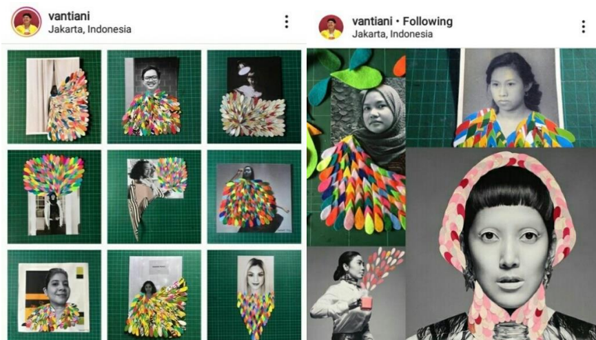
Figure 1. Custom made collage artwork from Puan Bantu Puan art initiative

In the Puan Bantu Puan project, almsgiver can contribute by ordering Ika's collage artwork, tailor-made for each individual. People can send prints of their chosen photographs to then be turned into handmade and customized collage artwork, as shown in Figure 1. There were a total of four batches of the Puan Bantu Puan art donation project, stretching from March to November 2020, with each batch limited to a total of five collage pieces due to the fact that it is a custom handmade artwork that requires a lot of time and craftsmanship to produce. The Puan Bantu Puan project donated 85% of each artwork to Sanggar Seroja, a creative space for transgender communities and groups to channel their artistic talents, located in Kampung Duri, Jakarta, formed in 2016 (Irham, 2018) and also to several other transgender communities in Yogyakarta.