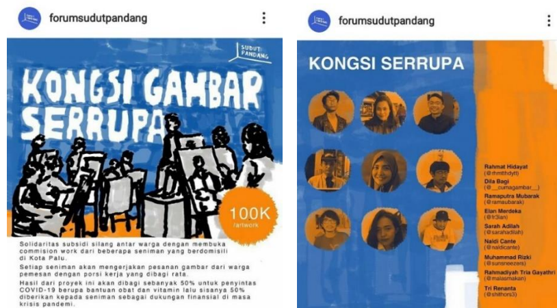
Figure 5. The second Batch of Ilustrasi Donasi was announced in July 2021

Palu, they initiated a The Kongsi Gambar Serrupa as way to contribute in helping those affected by the situation. There are nine artists involved and almsgiver can commission an artwork, drawing or illustrations based on their requested image or photographs, as shown in Figure 5. The proceeds from the Gambar Kongsi Serrupa project is then used for cross-subsidies where 50% of the income is donated to aid medicine and vitamins for Covid-19 survivors and the other 50% is given to artists as a financial support during the pandemic.