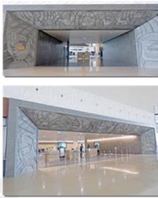
Figure 5. Hastabrata in Yogyakarta International Airport

Hastabrata talked about the principles of Javanese leadership. The word "Hastabrata" comes from the Hindu Sanskrit book, Manawa Dharma Sastra , which means that the royal leaders act according to the character of the gods represented into eight natural elements, namely earth, sun, sky, ocean, fire, wind, moon, and stars.