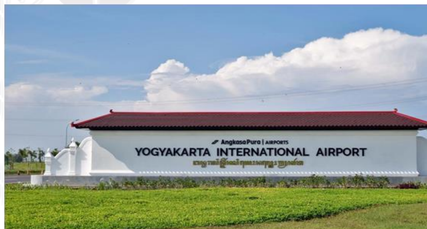
Figure 2. Joglo Semar Tinandu in Yogyakarta International Airport