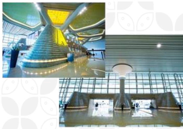
Picture 16. Gumuk Pasir in Yogyakarta International Airport