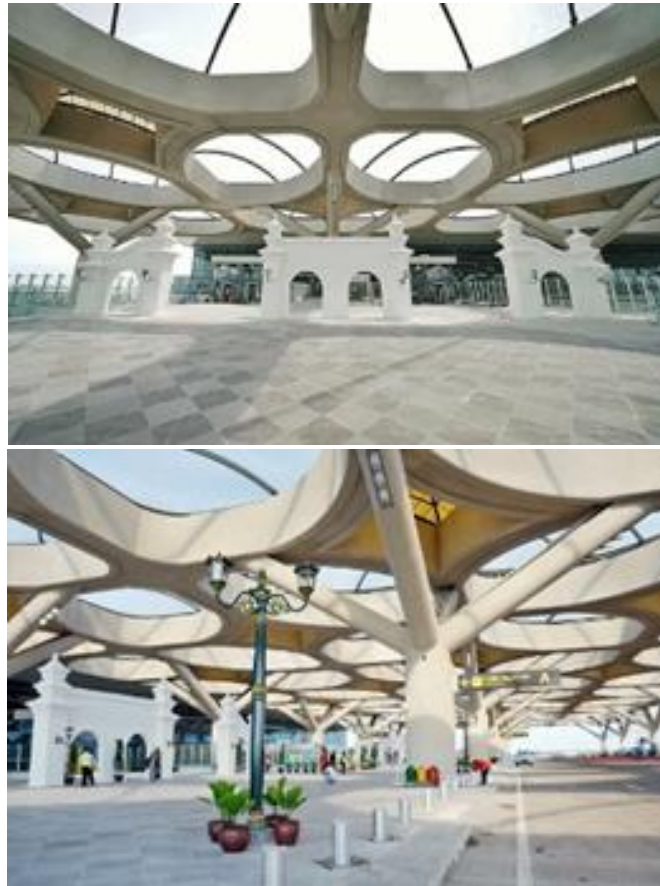
Picture 17. Plengkung Gading in Yogyakarta International Airport