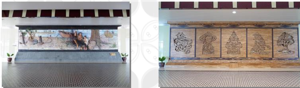
Picture 11. Panca Desa Design in Yogyakarta International Airport

The story tells about the romanticism of five villages (Glagah, Sindutan, Jangkaran, Palihan, and Kebonrejo) which were eliminated from the impact of the airport construction as an appreciation for the Kulon Progo people.