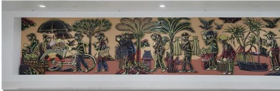
Picture 12. Among Tani Dagang Layar in Yogyakarta International Airport

are still the benchmark for trading systems and calendar systems for people in Java.