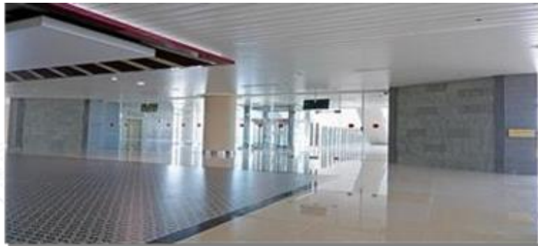
Figure 8. Babad Alas Palihan Nagari I in Yogyakarta International Airport

On Thursday, Pahing , 13 Sura 1682, coinciding with October 7, 1756, Sri Sultan Hamengkubuwono I and his family moved or moved from Pesanggrahan Ambarketawang to enter the new building of the Ngayogyakarta Palace.