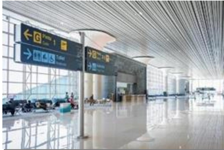
Figure 6. Panca Wiwara in Yogyakarta International Airport