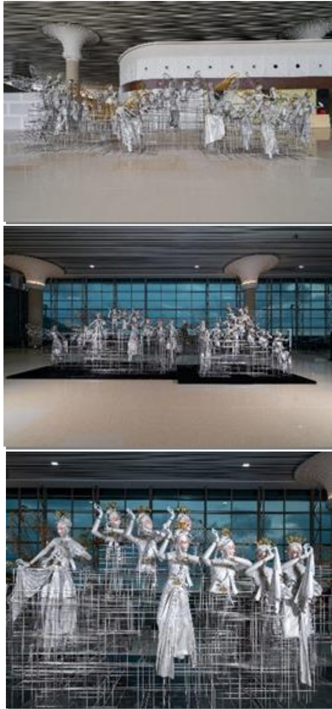
Figure 9. Statue of Tari Bedhaya Kinjeng Wesi in Yogyakarta International Airport