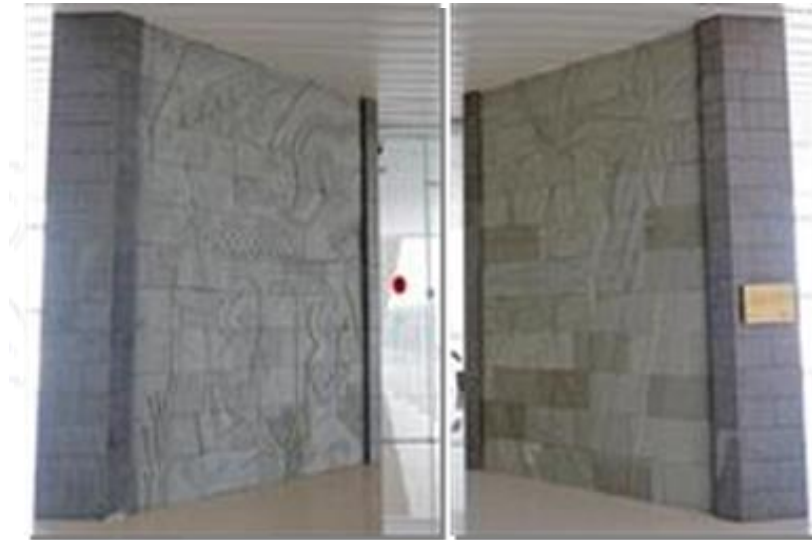
Figure 7. Babad Alas Pabringan in Yogyakarta International Airport

Alas Pabringan early birth of Ngayogyakarta and Babad Alas Nawung Kridha as the beginning of modern Mataram civilization.