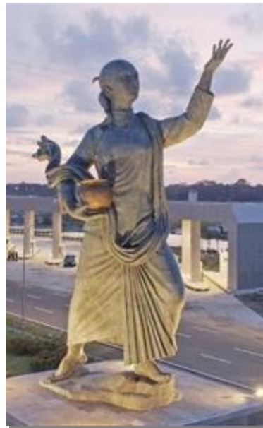
Figure 3. Hamemayu Hayuningrat Statue

YIA is the face of Yogyakarta and even the Nusantara civilization. Hamemayu Hayuningrat has a meaning as a civilization monument that preserves traditional values as well as a space for new civilizations to grow in accordance with the character of the people of Yogyakarta who are strong and flexible, feminine as well as masculine, a combination of the maritime and agrarian spirit. In line with the spirit of the Renaissance and among the tani trade screens, the manifestation of YIA is based on the noble values of Javanese culture that are dynamic in keeping with the times. YIA is a civilization monument that preserves traditional values as well as becomes a space for new and visionary civilizations to grow. The statue that placed at YIA serves as a greeting so that the gesture of this statue figure is as the host welcoming the guests. The choice to present a female figure is intended to accentuate further the symbolization of the motherland in relation to the concept of father-to-earth. Visually, the statue is a figure of the motherland, which is the location where we live and protect life on earth. The figure of a woman depicts fertility, life, activity, and Javanese women