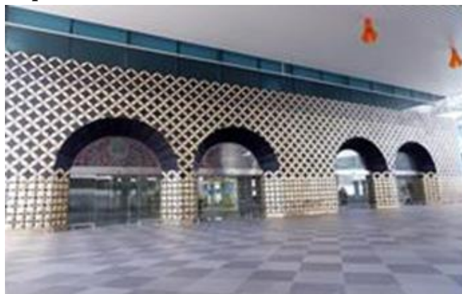
Picture 14. Lawang Papat in Yogyakarta International Airport