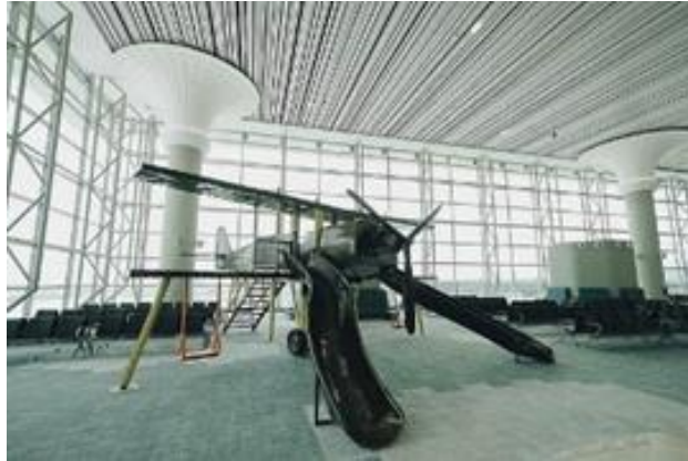
Figure 10. Wahana Among Bocah in Yogyakarta International Airport

Among Bocah is a playground for children in the form of a biplane. In the manufacturing process, artists are very concerned about artistic and aesthetic effects so that they are unique and not the same as playing areas elsewhere that seem uniform. This play area is safe, comfortable, and fun for children and a place for education and cultural introduction through traditional games (swings, slides), which are packaged in a modern and artistic form.