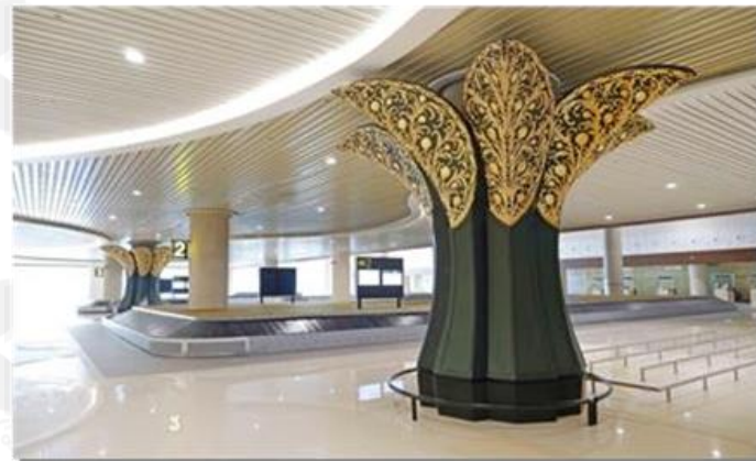
Picture 13. Tetanduran in Yogyakarta International Airport

Tetanduran (Javanese: plant) is a symbol of the local vegetation of Kulon Progo in the form of the mangosteen tree stylization.