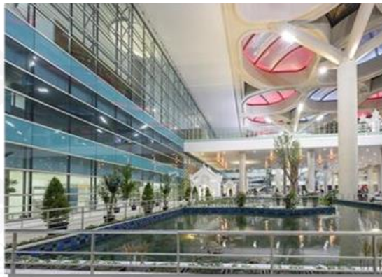
Picture 15. Tamansari in Yogyakarta International Airport

Tamansari , which means "beautiful garden", was originally a palace garden or the Yogyakarta Palace garden. Tamansari consists of several buildings, bathing pools, suspension bridges, water canals, artificial lakes, artificial islands, mosques, and underground passages. The park is nicknamed the Water Kasteel (water palace) because of the pools and water elements. Tamansari at YIA is a mini replica that adapts the original Tamansari .