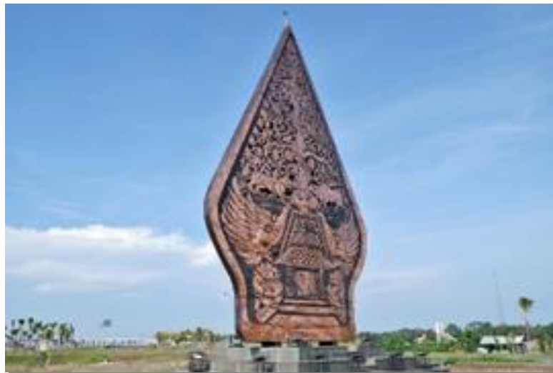
Figure 4. Gunungan Wayang in Yogyakarta International Airport

Wayang Gunungan is tapered upwards, which symbolizes human life. Everything in this world will eventually come back "up". The higher the knowledge and the older the man, the closer to the Creator. In addition, each character depicted in Gunungan symbolizes the universe and its contents, starting from humans, animals, plants, and all their accessories.