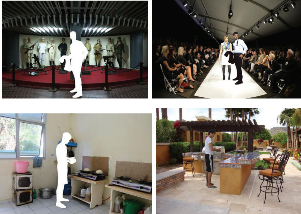
Fig. 1. Some of the works in the series 'Alhamdulillah We Made It'. The left picture is taken in Yogyakarta, the right photo is cultivated with a catwalk 'location' in Australia.

The advancement of information technology, especially the internet, greatly helps artists in finding the necessary information to strengthen the foundations of the concept of creation. The process of extracting information done through the internet lead them to find the appropriate stakeholders. In the case of this work, MES 56 traced information about organizations dealing with refugees. Based on these search results, MES 56 then studied and visited JRS under the International Organization of Migration (IOM). JRS was headquartered in Yogyakarta. "We came to JRS to seek further refugee issues, and we view JRS as a relevant institution. To find out the refugee problem, we are given a one day workshop, in order to understand the refugee problem, and so what we do in the refugee place do not become a new problem."