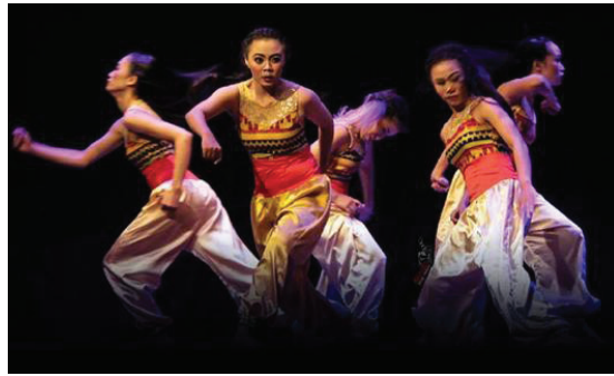
Pict 2. Restlessness Condition

Based on explanation on the first fragment that freedom is a condition which is hope by humans. On the second fragment when the body have can outside from limitation, the body already enter the constancy world. Constancy on this context interpreted as woman ability to keep her integrity by means of independent and responsible. In order to strengthen herself constancy, the shadows of tradition certain to will be follow and vamp so that the constancy become weak. Then, run away from wall tradition is once of way to free from restlessness arise by shadows tradition.