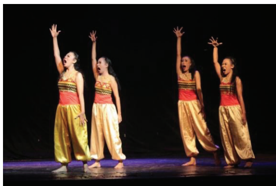
Pict 7. Anger

Failure and success are biner opposition which always stick in the effort. Woman sometimes get both of failure and success when she try to get her freedom from walls tradition. The picture above show that failure is condition that received by many women in order to struggle their freedom, but also when they get in failure it is not means the freedom can not be reach. This interpretation can be seem in motive and line of the dancers body movement. Based on the picture it is seem 4 dancers move with stoop motive movement while the the one dancer keep on try to steadfast eventhough on fall situation. If it is withdrawn in the line movement, it will be show means that feel in many failure will be make her get the strength power. We are lose but we had resitance with respectful and powerful (Pramoedya Ananta Toer, 2009).