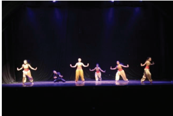
Pict 8. Woman power and integrity

The picture above was show be woman anger. From the movement motive and movement line show a firmness. Stand up movement motive and raise hands to the top while opening the mouth is to express anger. When it is look from dancer movement line that seem on stand up position is an firm line.