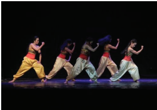
Pict 3. Resistance

The restlessness appears on movement line which is doing by dancers when they do run movement ro right side, left side, front side and back side. The run movement is unpredictable and irregular. The unpredictable and irregular movements arise from alternate and canon movements that used on exploration and improvisation. Beside that, intuition that raised by sound of the music which is combain with speed of run tempo the dancers became to influence the intensity of restlessness that arised by the dancers body. The combination between music, motive and tempo finally show the expression likes the picture above.