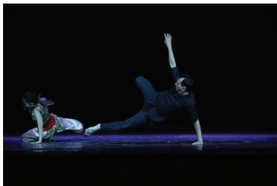
Pict 5. Distraction

If line of movement the man dancer who is jump in the air was withdrawn it seem as bold black line which is be above position, while the women dancers if it was withdrawn the movement line it seem likes stones that fall to the ground. Combination of that lines is give impression about there is failure on destroy the sturdy wall tradition. The others supporting oh fail condition Lampung's oral literature (hahiwang) and the sound of flute that it was means lose.