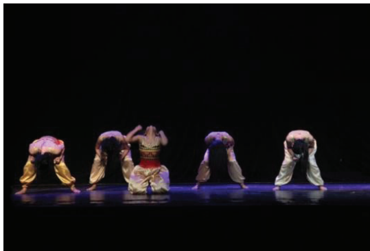
Pict 6. Constance to resistance

Based on the picture above it was seem woman dancer who is try to move her body to the other place, while the man is try to block her. Both of man and woman dancer in the picture above there is line of relation. Woman dancer movement line is connect to man dancer movement line, by this distraction situation can be concluded as woman effort to free from tradition that still block and follow herself. Distraction situation on this fragment not only get by the movement, but also the distraction seem on the music that represented by sound of triangle and tibet vocal to interpret the power of tradition.