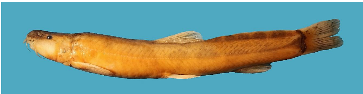
Figure 2. Paracobitis vignai , about 25 cm in TL, Sistan basin, Iran.

complete, reaching to base of caudal-fin, with 118-121 pores. Cephalic lateral line system bears 9 supraorbital, 4+15 infraorbital, 13 preoperculo-mandibular and 3 supratemporal pores. Nostril is slit-shape and flap does not covers the nostril.