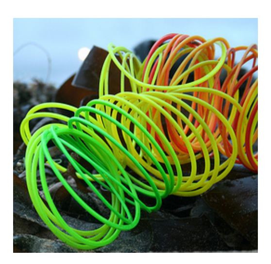
Figure 2. Symbolic representation of the impacts of colonialism on interconnections in Cree worldview.

Earlier, a spiral was presented (Figure 1) that illustrated an interconnected worldview that was supported by the Cree teachings of wahkohtowin and Natural Law. When the Cree people were prevented from teaching these values, rules, and way of life, the scaffolding that ensured healthy, respectful relationships was severely damaged, and the spiral collapsed upon itself. The critical relational boundaries were transgressed. The spiral, for some families and communities has become a tangled, chaotic knot as illustrated in Figure 2.