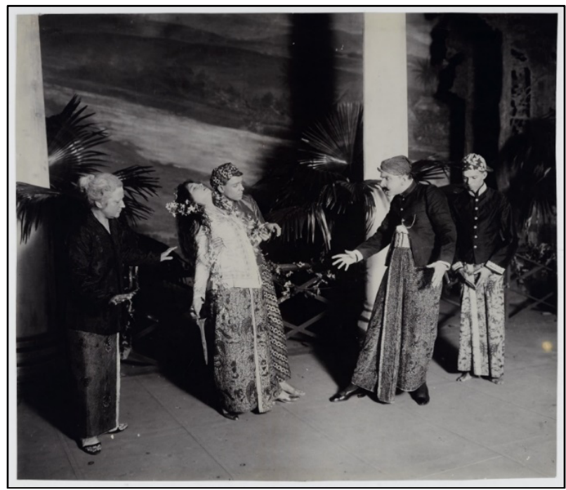
Figure 5. A Shot from Karina Adinda by Victor Ido, 1913

looking for entertainment similar to the European ones while still using themes relating to their lives.