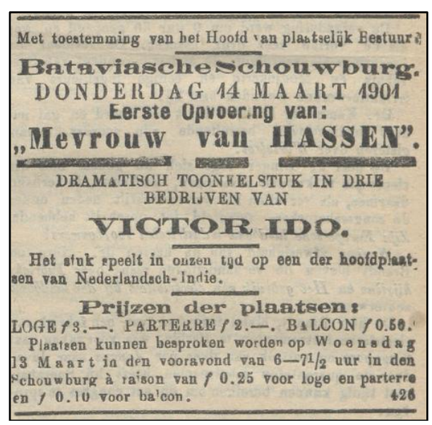
Figure 3. Advertisement of Victor Ido's Mevrouw van Hassen 's Premiere Showing in the Bataviasche Schouwburg , 14 March 1901.

dream of elevating the arts world of Batavia, an effort highly appreciated by Batavians (Dijck, 1901).