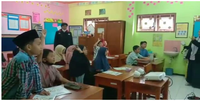
Figure 5. Teaching activities in the classroom led by teaching assistants