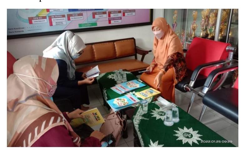
Figure 4. Interview session with the school principal of SD Aisyiyah Kota Malang to evaluate the program

Lastly, after the implementation of the CLIL program, the project team assessed the outcome from the program. The evaluation stage involved the school principal, the teachers, the volunteers of the PMM program, and the students. Overall, all related stakeholders deemed positive feedback.