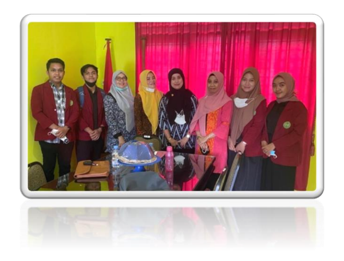
Picture 1. Reception with principal, vice principal, and English teachers.