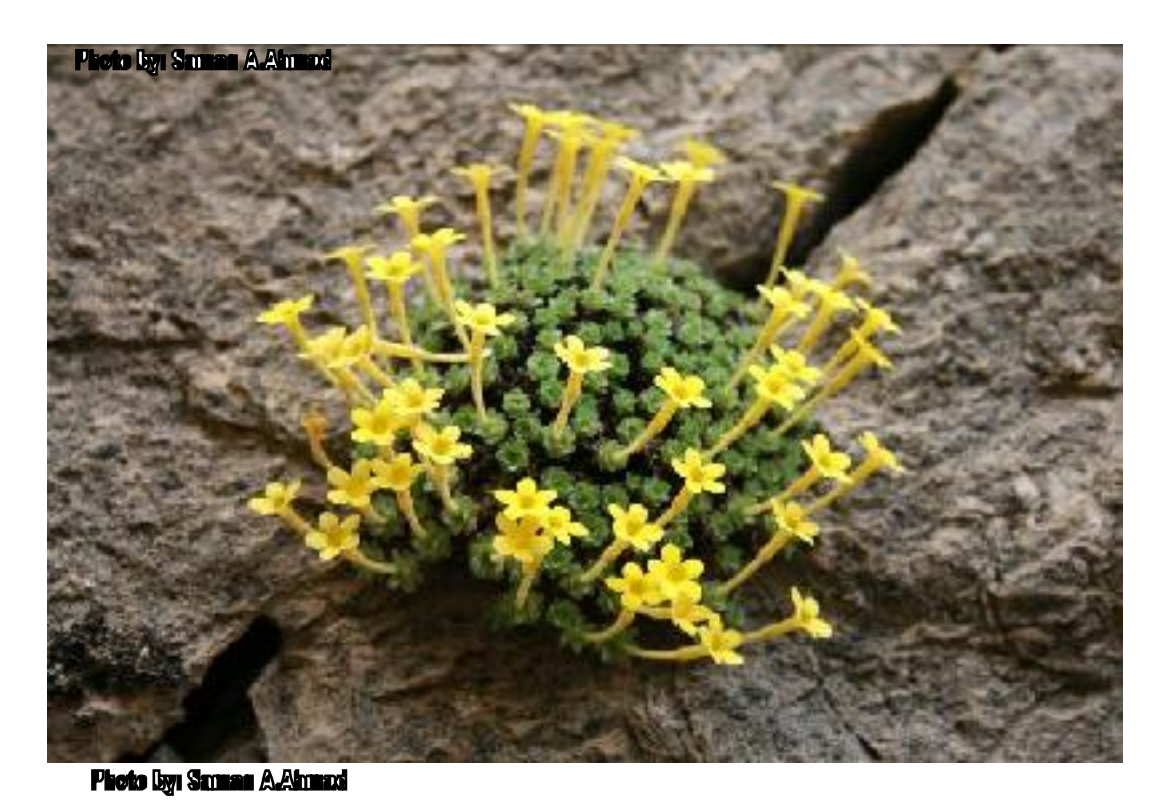
Fig. (2): The D.odora plant in its Natural Habit.