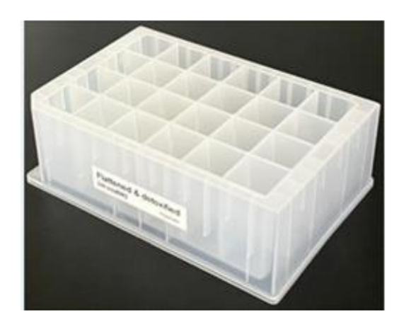
Figure 1. Deep-well microplate

The ability of the strains to produce erythritol and the conditions required for erythritol fermentation were examined in order to increase the efficiency of production and achieve the highest possible erythritol concentration. The effects of the initial pH and C:N ratio were investigated during the fermentation. Given that previous studies [12,14] have shown that proper osmolarity has a significant effect on erythritol production, the effect of changing it was also investigated to determine the most appropriate range of osmolarity for erythritol production with these strains. The main consideration was the comparison of two substrates, that is, glycerol and glucose, in terms of erythritol production. After determining the most efficient fermentation conditions, our intention was to scale up the process. In the case of significant erythritol production, extraction of the product from the fermentation medium was sought. Our aim was to use the residual cells, e.g. Yarrowia lipolytica lysates, to further investigate cosmetic purposes after ultrasonic treatment.