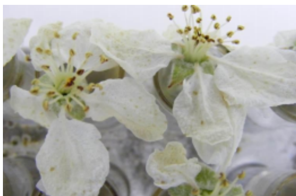
Figure 3: Infected apple blossom treated with the bio-preparation.

ing biological agent [14, 15]. This successful treatment is illustrated in Fig. 3.