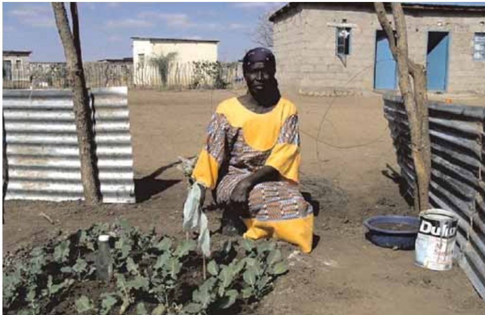
A woman in Bobonong, Botswana, proudly tends her door-sized garden.

addresses how to provide community support for patients not yet clinically eligible for ARVs. STF learnt the importance of this, because inattention to these patients can demotivate them and they may then drop out of the programme. STF also learnt that selection of patients for ARV therapy should be based largely on clinical criteria and remain uninfluenced by social discrimination, because social and psychological problems can usually be managed.