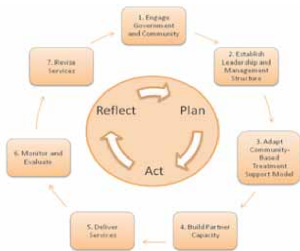
Fig. 2. The seven-step process.