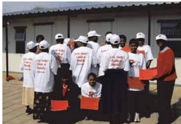
'Buddies' trained by the NGO COCEPWA in Gaborone, Botswana, prepare to go to work.

Step 6 guides the development of a monitoring and evaluation framework while step 7 explains how to reflect on progress, successes and challenges, making use of monitoring and evaluation data. Corrective action can be taken with input and agreement from relevant partners.