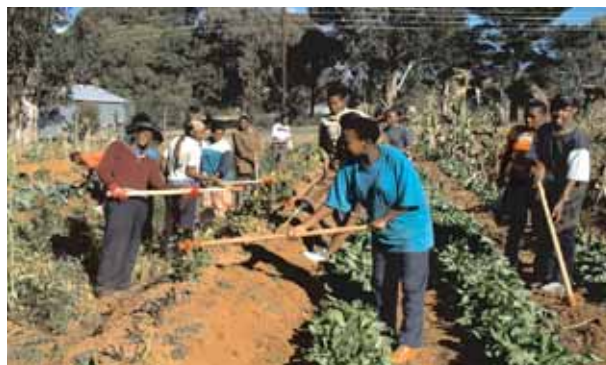
Food security in action: Workers in their community garden in Lesotho.

In publishing the manual, it is the hope of STF that the experience gained and lessons learnt can be utilised by others wishing to provide holistic and effective care and support to patients with HIV/AIDS in resource-limited settings.