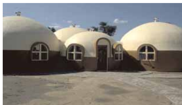
In Namibia, an NGO Village was constructed inexpensively employing indigenous construction techniques.

Capacity building is not just about training, but can be facilitated by providing appropriate, sometimes innovative upgrades or modifications to workplaces and other physical structures. STF also learnt that training personnel to understand the CBTS concept itself is necessary for effective implementation.