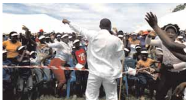
More than 5 000 people attended the public launch of the ACHIVA programme at Ladysmith Provincial Hospital in KwaZulu-Natal, South Africa, in 2004.

The first objective of this step is mobilisation of the community to support and engage in new and improved services, particularly newly accessible ART and community services integrated with ART. Thereafter attention is paid to how to deliver high quality, accessible and integrated clinical and community services to the targeted numbers of patients, how to prepare patients who need ART for treatment and how to track and retain them in the programme. The manual also