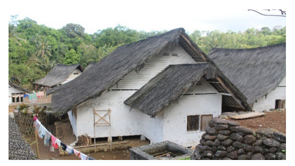
Figure 1. The housing pattern of Kampung Naga

The houses are the house on stilts with space beneath the house functions as chicken or duck coop, or as an agricultural tool and firewood storage. Kampung Naga residents call the house as they call themselves as the house has a head, body, and legs. The houses in Kampung Naga basically have the same basic pattern, arranged lined extending from west to east, rectangular in length and face to face. The function of the house that facing each other is to make the residents pay attention and communicate with each other s, in accordance with their lifestyle that is to hold togetherness and have a family life (Nurjanah et al, 2013).