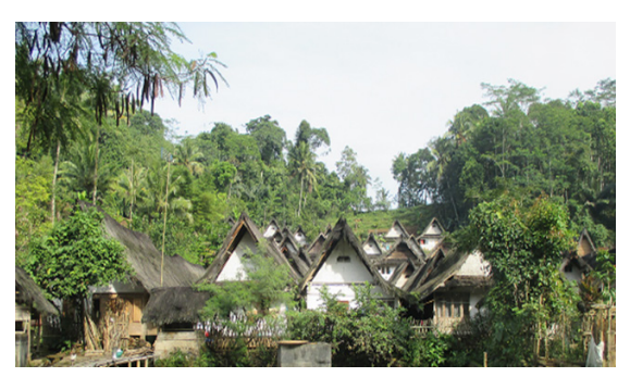
Figure 2. The Atmosphere of Kampung Naga.

Basically, those who live outside Kampung Naga are still bound by the village custom and are still recognized as part of their community. So in every ceremony of the traditional ceremonies, they come to Kampung Naga to make pilgrimages to the sacred tombs that are considered as the graves of their ancestors. However, for those who live outside Kampung Naga, they are not bound by the terms and conditions to make the house on stitlts and other rules (Nurjanah et al, 2013).