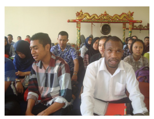
Figure 2. The Salendro Tone Learning Process in Sundanese Song Learning

Example in Figure 2 shows one of learning stage in the Gordon audiation in Major tonal, from Tonika to the Dominant. It shows varied interval movement that is started with rise and falling kwint interval, then is continued with rising and falling terts. The strengthening of tonal feeling in Gordon's learning stage entitled taxonomy of tonal patterns gives one a hearing sensitivity by singing various interval written in Figure 2.