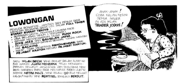
Figure 3 . character of Ny, Netra Wilis as the representation of Javanese leader.

The signs are shown on Ny. Netra Wilis character could be interpreted as the connotative representation of a strong Javanese leader (it is shown by the appearance of Ny. Netra Willis through the sign of kebaya, sanggul, and jarit while sitting on a carved chair), wealthy and extravagant (the sign of a luxurious necklace), but still showed modern ideas (the sign of reading newspaper), modern lifestyle (the sign of glasses). Those denotative signs were a metaphoric analogy of Indonesian political leader in Orde Baru era who was strong and authoritative just like a king ruled in traditional Javanese politic.