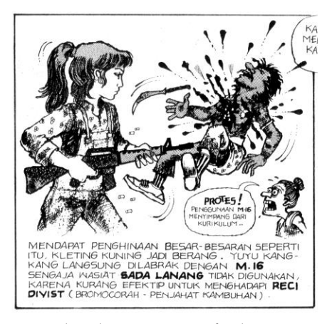
Figure 4 . the description of Klenting Kuning fighting Yuyu Kangkang by Shooting him.

Uniquely, the modern signs such as guitar, piano, sound system, radio, jeep, jeans, and sneakers were easily attached to the characters. This induced the perception and interpretation that Javanese culture was distinct and stereotypical: that is as a contemporary culture that opened to another culture and acculturation.