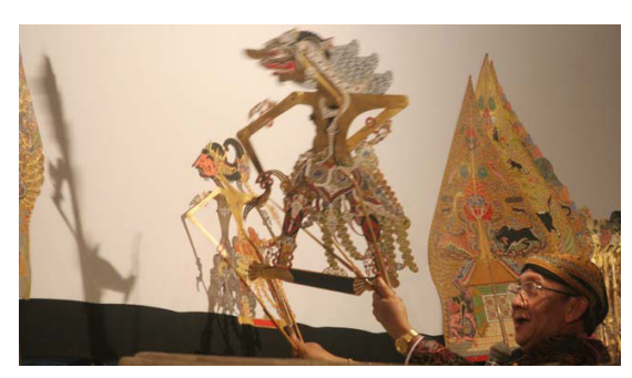
Figure 1 . Ki Manteb Soedarsono playing shadow puppet at UNNES Anniversary, 2012. (Document by Dhoni Zustiyantoro).

is oriented toward the female body. That is because luwes often becomes a unit in the phrase gandes luwes , which is associated with beautiful movements and captivates a woman's heart. The meaning of luwes in the context of art is a character that is interesting and flexible in adapting to certain audiences and contexts. If it is associated with puppet performances, then flexibility can mean that it is easy to adapt to context and needs, appropriate, and interesting to watch (Sudarsono, 2007).