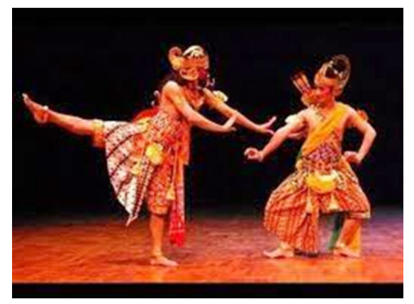
Figure 2. Wirèng pethilan "Bambangan-Cakil" (the telling wirèng)

In sub-sections or war scenes, there are variations in a spatial formation called gawang prapatan (crossroad spaces), gawang jeblos (opponent space/places), and gawang pojok ( pendhapa rectangular corner spaces). After the war scene is finished, they dance again, then it is continued with the final part of the dance ( mundur beksan ); (3) the final part of the dance is the same as the initial part of the dance, namely, the dancer returns to the starting position, gawang sopana . The difference lies in the intended direction, namely the movement in the