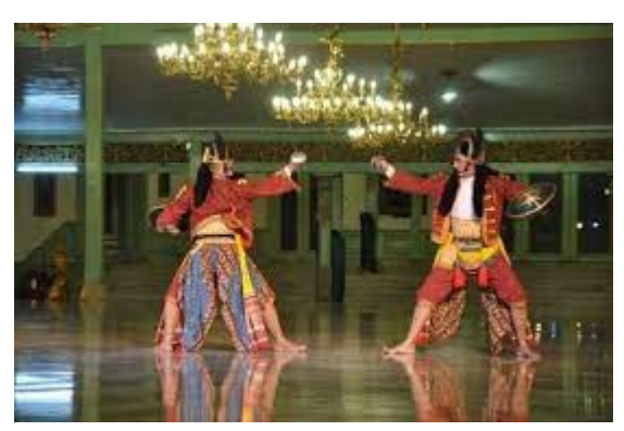
Figure 1. Wirèng "Bandayuda" (non-telling wirèng) (romadecade.org/tari-beksan-wireng 2021)

wards the essence of the dance ( beksan ); (2) the main part of the dance is that the dancers are in the main gate (middle room/ pendhapa center ) doing dances, madas wars, ruket wars, and more dancing. The following is an example of a storytelling wirèng ( pethilan wirèng ) and a non-telling wirèng (See Figure 1 and Figure 2).