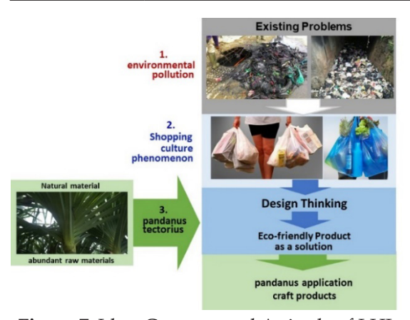
Figure 7 . Idea, Concept, and Attitude of LHL Design (Sustainable Lifestyles) (Hendriyana, H; Putra, IND, 2021)