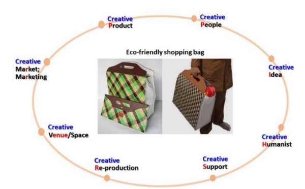
Figure 8 . Product Application of Sapta Cipta Preneurship (Hendriyana, H; Putra, IND, 2021)