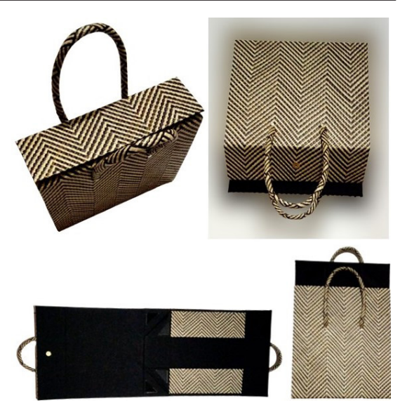
Figure 9 . Product Application Practice-led research Kriya (Eco friendly Packaging for Boutique Fashion) (Hendriyana, H; Barnas, Asep, 2022)