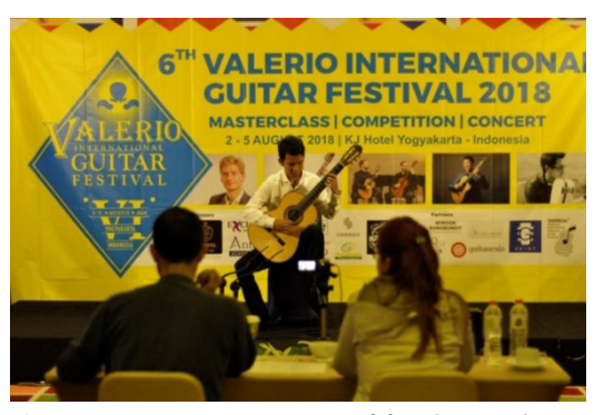
Figure 3. Seating position of finalist and jury

In addition to explaining the idea of intrinsic motivation, Lehmann et al. (2007, p. 49) also explain extrinsic motivation factors, which are important aspects of one's musical development. The main extrinsic sources are parents, teachers, and peers.