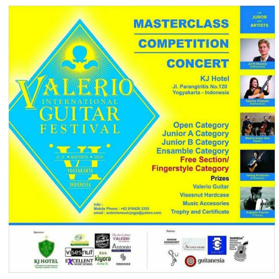
Figure 1. Poster Valerio International Guitar Festival 2018

One of the competition categories in the 2018 Valerio International Guitar Festival, which is the focus of this research, was the open category or open-to-the-public category. In terms of the age level, this category was the highest category because there was no age limit in it. Anyone might register and participate by following the rules made by the committee, namely: playing a single guitar within a time limit of no longer than 10 minutes in the preliminary round, which was held on August 2, 2018, wherein the 10-minute duration participants might play more than one piece of Music or repertoire. After the preliminary round, there were eight finalists who were fully determined by the jury to advance to the final round. In the final round, the selected finalists were asked to play a single guitar for a duration of shorter than 17 minutes, in which the finalists might play more than one piece of repertoire.