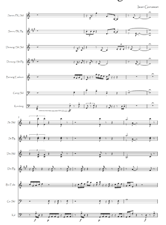
Figure 13 . The beginning of the work "Noname and Nothing" with gamelan slendro pelog tumbuk A

If we look at the notation above (especially the beginning), each striking instrument has an independent melodic texture. In this section, the beats on each instrument are not related to each other except at the end of the melodic sentence which emphasizes the difference in the sound of the tone "3 (na/lu) between the waditra