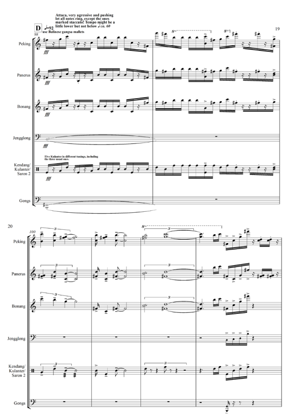
Figure 4 . Excerpt of Tutti melody in "Cross-current"

Meanwhile, the technique of limiting the number of tones in the work "Crosscurrent" has a different case. This work uses the Degung gamelan , but auditorily the characteristics of the gamelan tones as in the traditional context can no longer be felt. This is due to the unique and unusual processing of the melody as the Sundanese artists process the melody in the laras. For example, please see the example notation below.