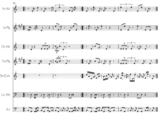
Figure 14 . The texture of the percussive sound at the end of the work "Noname and Nothing"

Another thing that will be described in this work is tone processing at the end. In this section, almost all instruments play short sounds to produce a percussive sound and avoid a melodic impression. In addition, the dialogue tone "2 (ro)/4 (ti)" and "3 (lu)/3 (na)" from the two tones is very dominant, to question the micro-interval differences between the two tones. For clarity, please see the example notation in Figure 14.