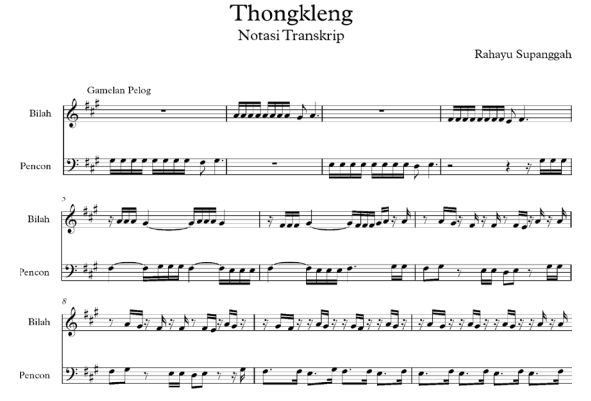
Figure 2 . Excerpt from the work "Thongkleng", Transcript by the authors.

more details, please see the transcript of the notation below.