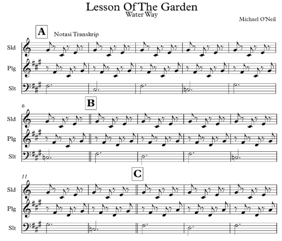
Figure 7 . Excerpt of rewards from "Lesson of The Garden-Water Way". Transcript by Iwan Gunawan

In the work "Lesson of Garden," the laras use a mixture of gamelan with pelog and slendro laras simultaneously. Thus, the mixture of the two laras auditorily produces new laras characteristics. One of the reasons for this is the technique of melody processing which deliberately hides the character of the pelog and slendro laras as in traditional gamelan music. Before going any further, look at an example of the notation below.