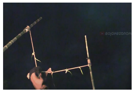
Figure 4. Kalongking Attractions (Action of Kalongking , according to public belief, moves because of the influence of supernatural beings)

The acrobatic attraction is performed with the eyes closed, climbing on the east bamboo pole and dancing in a bat-style movement which then hangs on to hook its legs on a rope with its head down and will descend on the west pole. All scenes shown through Kalongking represent every human being in the center ( pancer ) of life which is connected to the vertical pancer and horizontal pancer dimensions.