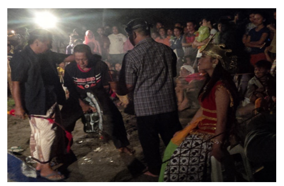
Figure 3. Jaranan Dance Scene ( Jaranan dance, according to people's beliefs, moves because of the influence of supernatural beings)

When the Jaranan dance scene begins to be presented, a series of songs are sung, which is believed to be a form of offering to mediate with spirit energy (ndadi). For example, the Jaranan dance scene (Mbesa) is accompanied by the song Kembang Le Li Le Lo Gempol, and then the Jaranan begins to circle the outside arena (Mubeng Blabar) accompanied by the Kembang Johar song, which serves to limit the pressure of the audience from the sacred arena. Next is the Jalok Ngombe in Jaranan scene accompanied by the song Kambang Jambe and the Jalok Leren scene accompanied by the Kembang Duren song. While releasing energy (awareness), the Jaranan players are accompanied by the song Kembang Jambu which means Jaranan asks for sleep.