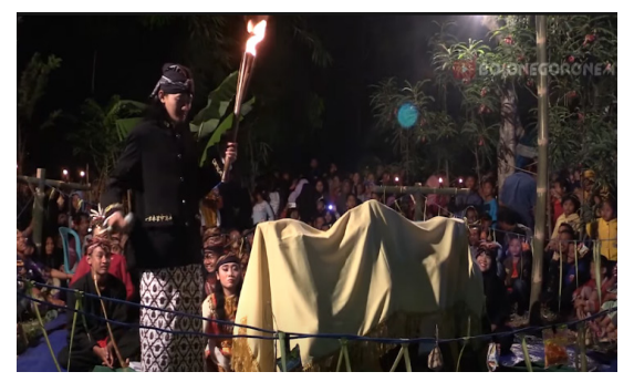
Figure 4. Pimp Nggundhisi scene ( Mendalang tells of the descent of the holy spirit "goddess" totaling 44 down to earth)

All the role players entered the arena stage accompanied by the song Kambang Otok with their heads covered with cloth, guided by makeup artists who carried torches as a guide to enter the arena. Then the torch was handed over to Pimp to circle Blabar Janur Kuning in a clockwise direction until he reached the north side facing east. In the next scene, Pimp starts Nggundhisi, the mastermind, who tells of the descent of 44 female holy spirits (goddesses) down to earth. Some are believed to have any involvement in shaping the characters in Sandur, becoming a kind of incarnation, or possessing the bodies of Sandur's role players. Among them is the incarnation of a goddess named Wilutomo, who entered the body of Pethak, Drustonolo entered the body of the Balong character, Gagar Mayang entered the body of Tangsil, and Suprobo entered the body of the Cawik figure. The incarnation of Irim-irim possessed Pimp, Panjak Ore, Panjak Kendhang, Panjak Gong, Kalongking, Craftsman Njaran, and other figures. The characters of the goddesses are believed to be incarnated in the body of the role players. This performance relates to the characters in the epics Ramayana and Mahabharata, which are often performed in wayang stories.