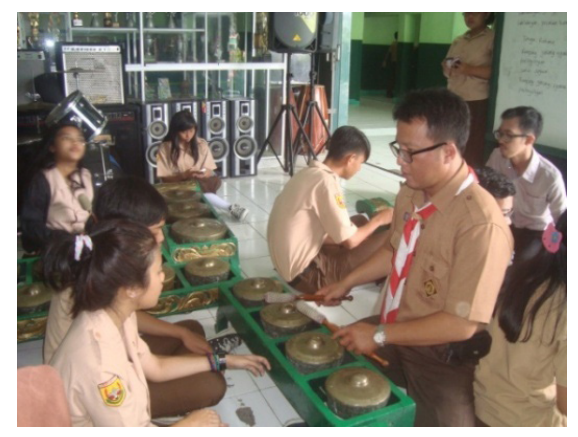
Figure 2 . In-Service Teacher Gave an Example to Students (Documentation by Latifah, April 2, 2014)

The results of the study have successfully revealed the roles of in-service teacher to prepare the pre-service teachers, as follows: