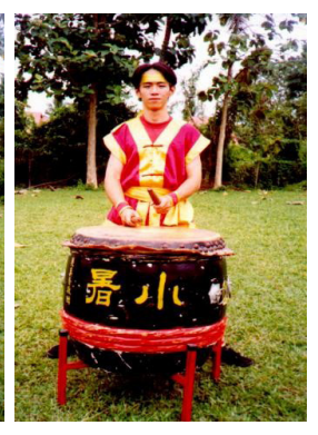
Figure 5. Position 4 Bei