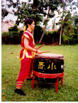
Figure 3. Position 2 Nan