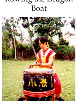
Figure 19. Position 4 Rowing the Dragon Boat