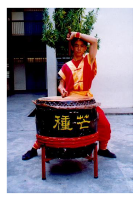
Figure 24. Position 1 Shou Ge 1

In Shou Ge, the 24 Jie Ling Gu ensemble mimics the movement of farmers harvesting their crops with a sickle (Figure 24-26). The drummers stretch their right hand up and bend it to an angle of 90 degrees. They then move it in a circular motion of 360 degrees over their head. The legs are slightly bent simultaneously with the movement of the arm around the head. beat These three movements occur during the second and third rest in each bar (Figure 27)(Chan, 2022).