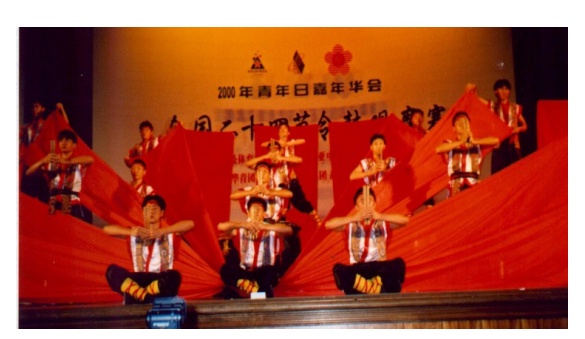
Figure 33. Meditation and Prayer