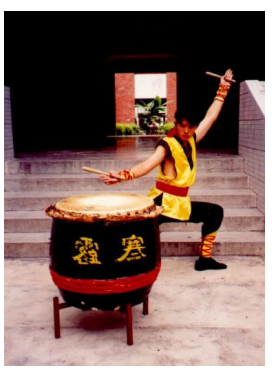
Da Peng Zhan Chi 1