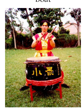
Figure 18. Position 3 Rowing the Dragon Boat