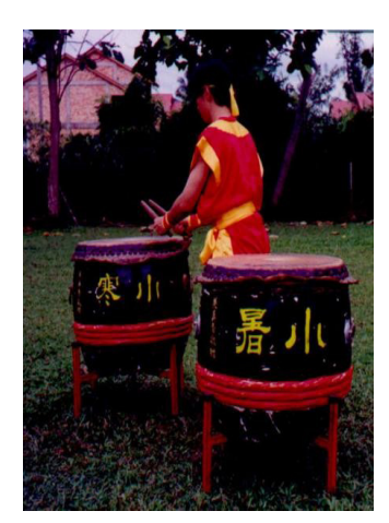
Figure 30. Position 3 Da Gu