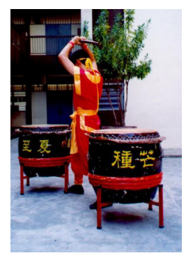
Figure 29. Position 2 Da Gu 2