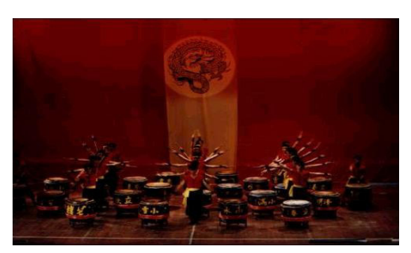
Figure 32. One Thousand Hands of the Guan Yin, Goddess of Mercy

The aura of winter is reflected by the choreography of Meditation and Prayer. In this choreography, drummers clasp their hands together holding the drumstick in vertical position (Figure 33). This pose mimics the action of holding joss stick in their hands. This "joss stick" is held high with the palm of the hands at nose level. This choreography is accompanied by recorded music, usually from a selection of Chinese or Japanese songs. Red clothes are stretched over drummers in specific patterns as part of the choreography.