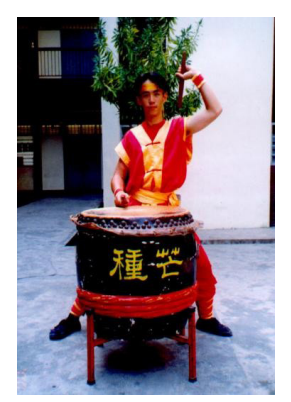
Figure 26. Position 3 Shou Ge 3