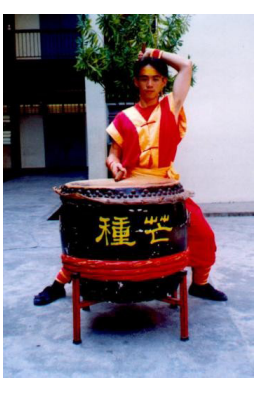
Figure 25. Position 2 Shou Ge 2