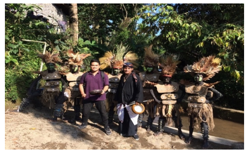
Figure 6 . Trunthung performers use rice straw and dried leaves as performance costumes

The use of natural materials as part of the performance is one of the evidence that natural always plays a role in every developing art in a region. A study entitled Penciptaan Kostum Kebo-Keboan (Sebuah Inovasi Kostum Pertunjukan Di Luar Acara Ritual) by (Hady, 2016) has found that a costume that has been designed holds the possession of artistic values. These values represent the icon of Banyuwangi, such as a motif, art, and tradition. So, it is no wonder that the costumes that have been worn in the performance of Trunthung Music reflect the condition of the agricultural environment that becomes the main livelihood for the people of Warangan Hamlet.