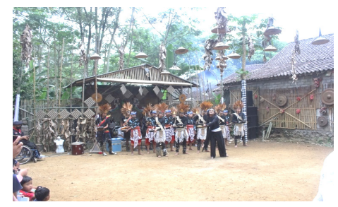
Figure 3 . Trunthung Music Performance at the Tapak Jaran Sembrani Ritual at Warangan Hamlet.

representation of the energic peasant life by the people of Warangan Hamlet. The statement is in accordance with the argument proposed by (Mulyana, 2002, p. 71), who states that human beings use symbols within the symbolic interaction in order to represent what they believe with one another and to influence the symbol as well when they establish interaction with both their social environment and their natural environment.