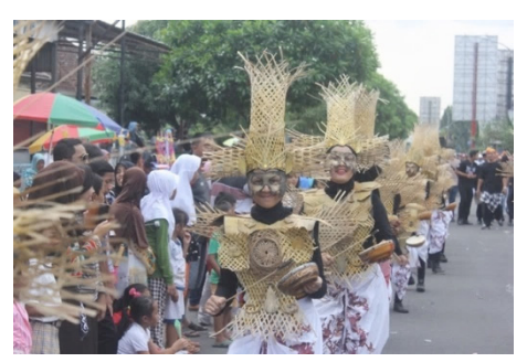
Figure 5 . Trunthung Music Performance in Magelang City Anniversary Procession by SMP N 4 Magelang

woven bamboo and batik cloth. In another performance, the costumes of the performers are made of straws and dried leaves as the main materials. This kind of costume can be seen in Figure 6 as follows.