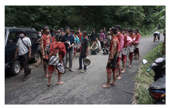
Figure 11 . Trunthung in the Procession of Nyadran Kali

graphical Conditions of Komunitas Lima Gunung Environment); and (2) Stakeholder Subject (Community-Based and Government-Based). Despite that, the present study captures several traditional rituals that have been performed in the Warangan Hamlet that involves Trunthung as part of the procession there. For example, Trunthung Music has been used in the procession of Ritual Nyadran Kali, which is shown in Figure 11.