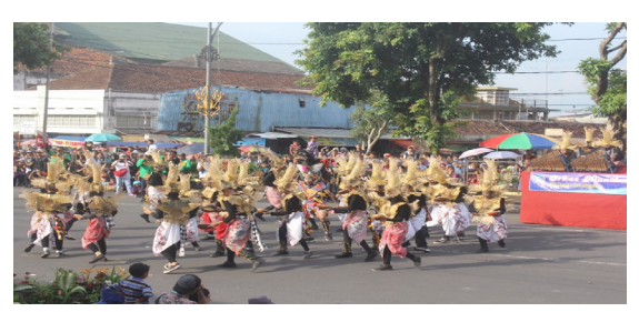
Figure 8 . The movements that the Trunthung musicians make while forming the floor pattern in their performance

Several studies on Soreng Dance and Topeng Ireng Dance show that Trunthung has been the control mechanism for the rhythm of both the movement and the music within every transition that the dancers do (Fitiriasari, 2019; Mumfangati, 2007). However, when Trunthung is staged as a musical performance, several characters belonging to both the Soreng Dance and the Topeng Ireng Dance can still be found among the performers who move around while beating Trunthung. This finding is interesting because the development that Handoko has pursued displays the sonoric dimension and develops the movement patterns that the performers of Trunthung Music show. The finding is shown in Figure 8.