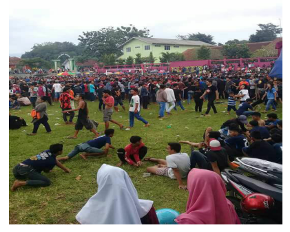
Figure 2 . Mass possession of the dancers and audiences

this combination. Usually, the groups have known each other's members; thereby, they do not fix the price for the performance. The fee to hold a Rayonan was paid by the organizer. The dance troop will get a transportation allowance of Rp. 500.000,00 to Rp. 1.000.000,00 depending on the distance from the group's studio to the location of the performance (E. Kusumastuti, 2020a). In Figure 3, Baruklinthing dance troop from Bejalen, Ambarawa is performing on April 11, 2018.