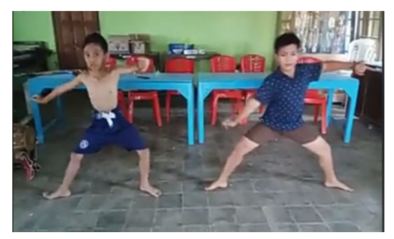
Figure 7. Rafka and Putra are practicing (Documentation: Ragil 2019)

groups of dancers in Facebook are Pecinta Seni Budaya Area Banyubiru (Banyubiru Art Appreciation Group). For this research, Reog'r has already had 78.1 thousand followers in Indonesia.