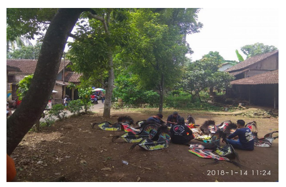
Figure 1. Pre-performance prayer

due to the spirit's invitation. The trances could happen at a sudden moment. The handlers were responsible for controlling the possessed people during the performance. The dance then continues with the culture of nyekar pepundhen (providing offerings), ngguyang jaran (handling the possessed), kepungan (controlling the possessed), citing mantras, and burning the incense. The handler prepares these activities before and during the events so that the performance can be executed well. The preparation includes asking the dancers to pray together before the public presentation (Figure 1).