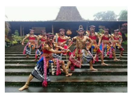
Figure 5. Langen Budi Sedyo Utomo group

changes of level and the element of dance composition. The backsound of the dance only came from bende , gong , and kendang . Nowadays, the back sound had additional sounds from pelog or slendro in the combination of pentatonic and diatonic music. The make-up and costumes of the dance followed the style of Surakartan ksatrian costume and make-up. In Figure 5, Langen Budi Sedyo Utomo group wears the make up and costumes for classical dance in Surakartan style.