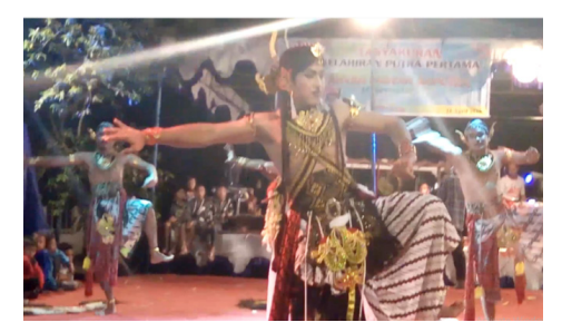
Figure 3 . Baruklinthing troop from Bejalen, Ambarawa

The performance of Jaran Kepang for dance festivals or tourist entertainment is different to the dance for a ritual. For the festival, Jaran kepang is performed by following the rules demanded by the organizer. The repackaging of Jaran Kepang is based on the Surakarta style of the dance. It is evident from the movements, back sound, facial make-up, costumes, floor pattern, and properties. The following picture shows a performance done by Langen Budi Sedyo Utomo troop in the Festival of Jaran Kepang on Dream Land, Salatiga, on