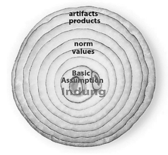
Figure 1 . Diagram of the Application of Ind-ung as Basic Assumptions

With this system, humans develop symbolic thinking and symbolic behavior as human characteristics that are different from animals.