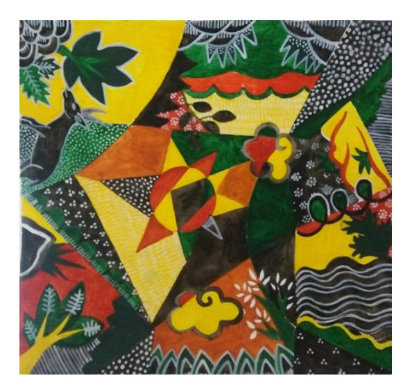
Figure 4. "Sumber Kehidupan" by Rini Maulina 2021, written batik 80 x 80 cm.

batik (see Figure 4). The visual style of batik is used as a Sundanese aesthetic concept. Sundanese aesthetic concepts are also found in Sundanese batik (priangan) decorations. The aesthetic aspect of Sundanese decoration has local wisdom values for Sundanese culture (Maulina et al., 2020).