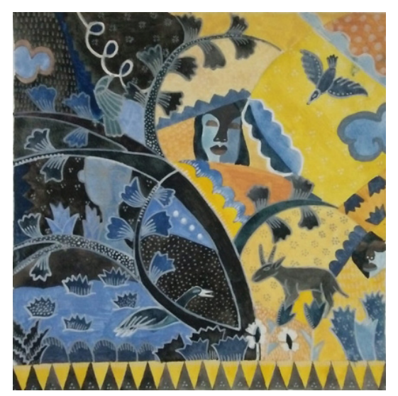
Figure 5 . " Merangkul " by Rini Maulina 2021, written batik 80 x 80 cm.

mans, animals, plants, trees, mountains, clouds, sun, and sky; b) Defection, the shapes depicted in the form of stylized batik visual style using the technique of written batik; c) Composition, the composition spreads to fill a square box, by dividing the diagonal curved line in the middle of the composition. The analogy tree of the meaning of indung to embrace as the main object is placed in the middle of the composition. Human, plant, and animal objects are placed around the composition, framing the main object; d) Expression, the media used is fibre reactive dyes (brand Remazol) on cotton cloth measuring 50x55 cm with written batik techniques and colet coloring techniques. The colors used are the colors found in batik cloth from West Java.