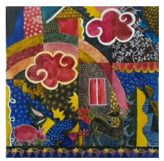
Figure 6. "Rumah yang Hangat" by Rini Maulina 2021, written batik 80 x 80 cm.

middle of the composition, views of mountains, clouds, plants, animals are placed around the composition, framing the main object; d) Expression, the media used is fibre reactive dyes (brand Remazol) on cotton cloth measuring 50x55 cm with written batik techniques and colet coloring techniques. The colors used are the colors found in batik cloth from West Java.