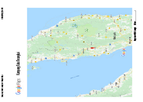
Figure 2. Location of research project: Kampung Bukit Terang, Kampar, Perak (near Kampung Batu Berangkai) in Perak.

This research project was conducted among a family of musicians known as the Bah Luj Musical Group. They live in Kampung Orang Asli Bukit Terang, in the town of Kampar located in the state of Perak (Figure 2).