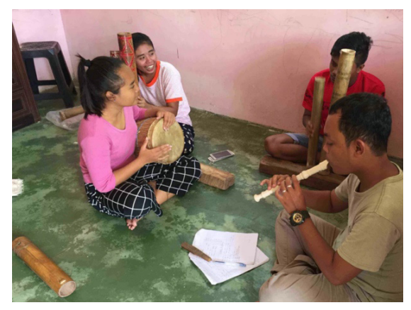
Figure 6. Young musician playing the rebana (frame drum), centong (bamboo stamping tubes) and recorder.