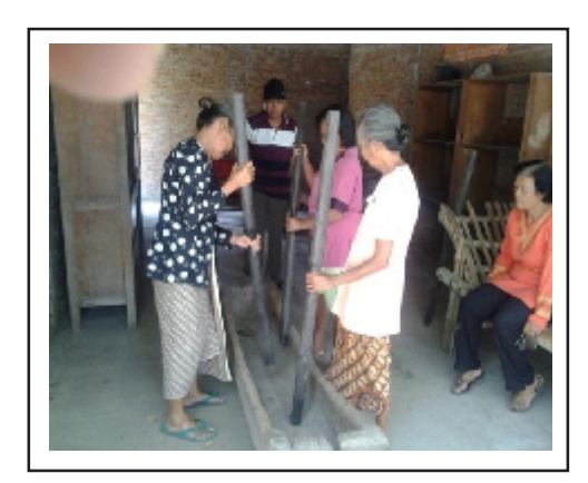
Figure 1. Lesung Players at Ledok

tion of Cepu International Heritage Club (CIHC) in the village of Ledok is concerned. Six players of lesung have been very old, and two members that usually play music suffer from stroke. The efforts of cultural inheritance is running very slow. In addition, the difficulties of transferring knowledge and skill of the old players, and lack of the interest of the young generation toward this kind of music bring the existence in a bad situation.