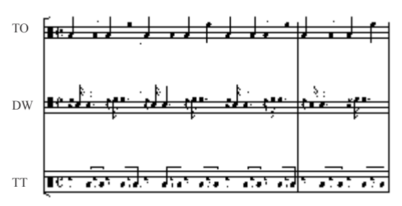
Figure 5 . Rhythm Pattern of Bluluk Ceblok