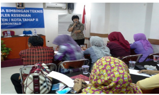
Figure 4 . Technical Guidance workshop in Gorontalo Stage II

Extracurricular activities will be used for the implementation of technical guidance in the following year. At the same time, reviewing the applicability of the Guidelines and the constraints that exist in the field. Researchers together with the central committee and other central supervisors gathered again to evaluate the results of Technical guidance activities that have been carried out starting from stages I and II in 2013. Various inputs from monitoring and evaluation results to schools in districts/cities in 12 Provinces are used as material to improve the contents of the Guidelines Extracurricular activities that will be used for the implementation of Technical guidance in the following year. At the same time reviewing the applicability of the Guidelines and the constraints that exist in the field.