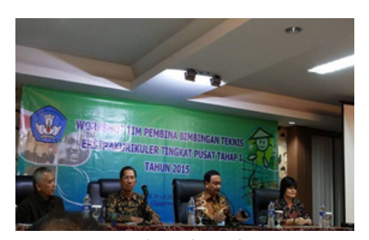
Figure 5. Technical Guidance Team Workshop

Technical guidance at the provincial level, the central guidance team together with the Provincial guidance team totaling 200 people from 34 provinces, formulated strategies for further implementation of technical guidance at the district/ city level, especially in the delivery of the Elementary School Arts Extracurricular Guide. Technical guidance activities at the district/city level, presenting different schools from the previous year. It is hoped that the attending schools will be able to hold extracurricular activities and be obliged to disseminate it. On this occasion, the researchers conducted technical guidance in Bengkulu.