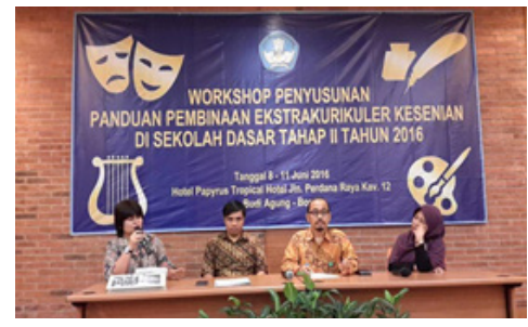
Figure 6. Workshop on Preparation Extracurricular Guidance Guidelines

cial level no longer exist. This is due to the enactment of Law Number 23 Year 2014 Article IV Article 9 Paragraph 1 which explains that the management of primary schools at the provincial district / city level no longer has the authority to manage elementary schools.