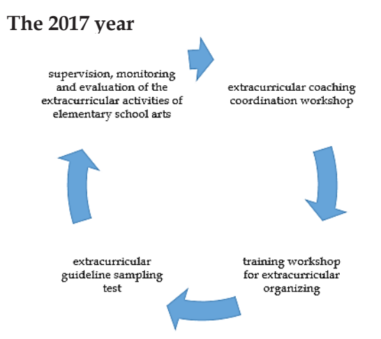
Figure 3 . Meeting Scheme Method in 2017

In 2017, Technical guidance activities were carried out at the central level in the form of workshops, workshops, and sampling, followed by the implementation of Supervision and monitoring and evaluation of Elementary School Arts Extracurricular Activities in 34 Provinces.