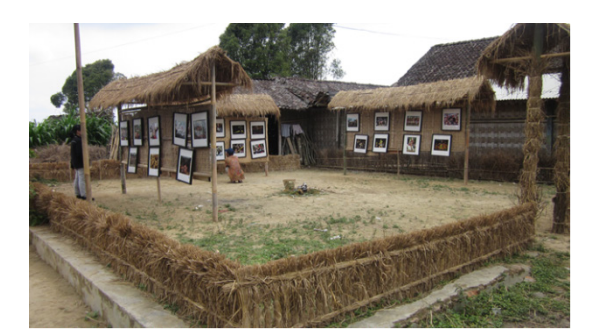
Figure 4. Photo Exhibition by Cultural Journalists

as to produce creativity to encourage the vitality of the mountain community becomes an elemental force. Panutan are role models used by the community as a source of reference in creating works. Panutan contains life value, in the role model profile is attached to expertise, or the mountain community needs people who have specific knowledge and the figure. As a panutan, Sutanto Mendut can present himself, both physically, emotionally, socially, and culturally in the middle of the five mountains community. The panutan have sufficient experience and ability to understand the village community, such as understanding various kinds of knowledge, potential, and uniqueness of the hamlets, each hamlet, is different. This experience is enough as capital for the community to encourage them to organize a five mountain festival.