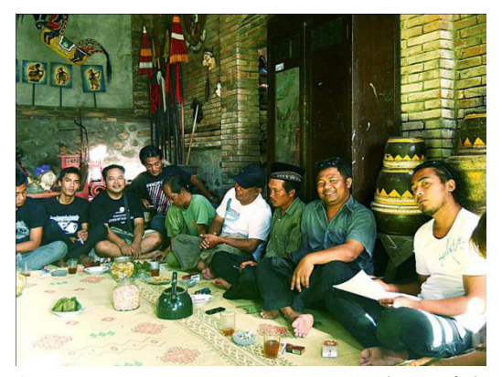
Figure 2. Discussion Between Members of the Lima Gunung Community

managing the community by making the value of togetherness a binding, causes the chairman's role to be less significant. Even in the extreme, without a chairman, the Lima Gunung Community art activities can continue. In Figure 2, there is a discussion situation conducted by members of the Lima Gunung community.