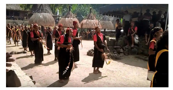
Figure 2. Ja'i dance in the Ka Sa'o ritual

In addition to the arts described above, Ngada also has a cultural tradition that is routinely carried out every year, namely