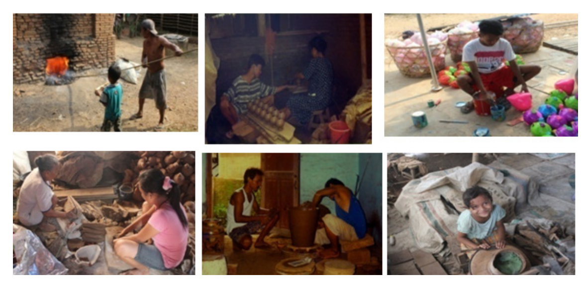
Figure 3 . Pictures of ceramic learning activities in the artisans' family environment

the production process. They have been trained informally in discipline, patience, perseverance, caution, care, and responsibility for what should and should not be done.