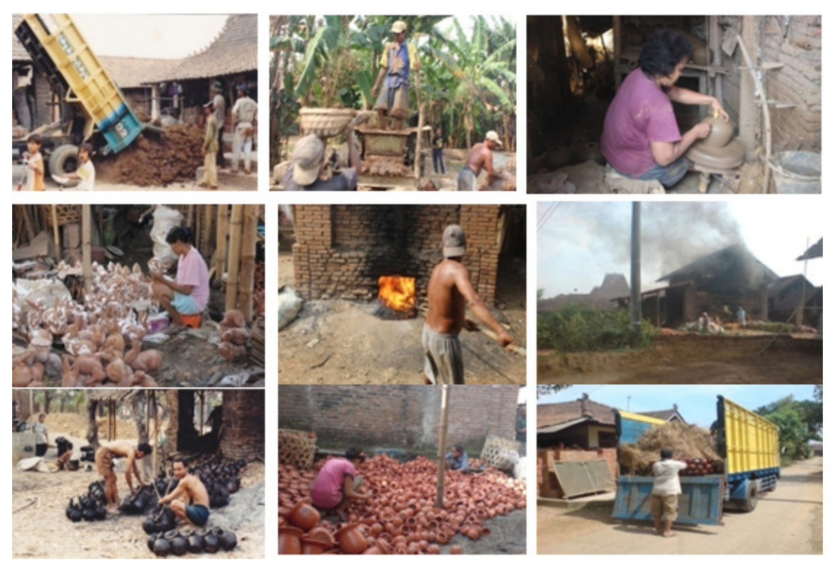
Figure 1 . The activity of Mayong Lor Village producing local ceramic art