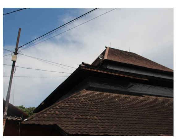
Figure 4. The porch of Masjid Agung Sang Cipta Rasa Cirebon (12 October 2018)

ped like Meru with a crest decoration or momolo. Some ancient mosques that have a meru-shaped roof include Demak Great Mosque (three stories), Kadilangu Mosque (two stories), Banten Great Mosque (five stories), and so on (Balai Poestaka, 1926). From the oral tradition that developed in the community that Masjid Agung Sang Cipta Rasa Cirebon did not use momolo, because, during the reign of King Panembahan Ratu, an epidemic struck Cirebon. To eradicate the outbreak, Panembahan Ratu released her wand, which floated until it grabbed momolo, until the momolo broke up. Since then Sunan Kalijaga advised Panembahan Ratu that for Masjid Agung Cipta Rasa no longer be made by Momolo, but instead, the roof was transformed into a pyramid as a sign that there is no superior human being (Sudjana, 2003).