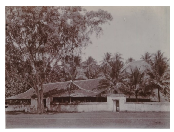
Figure 2 . Masjid Agung Sang Cipta Rasa In 1911

feeling, a true heart, and is a reflection and self-approach with the Creator, Allah Subhanahu Wata'ala (Sudjana, 2003).