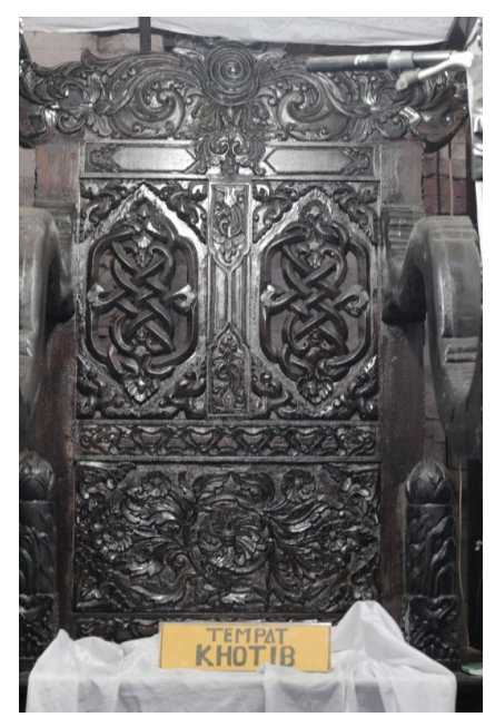
Figure 8. The pulpit (Mimbar) (4 December 2018)

pilasters, on top of which are decorated lotus flower bud motifs. Next to it is a carved lotus flower blooming in a square frame. At the end of a square-shaped pilaster carved ornate lotus flower bud motif. In the center of the pilaster, the body is carved meander decoration and at the very bottom, there is a pedestal, a round shape for a round and pyramid-shaped pilaster for a square pilaster. Pilaster decorated with twisted; the height of the mast 1.51 m, width 13 cm for the square and 14cm for the round, 8 cm thick from the front wall of the mihrab (Alamsyah, 2010). Here is the pulpit where the sermon is.