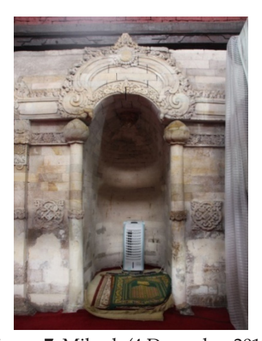
Figure 7. Mihrab (4 December 2018)

Mihrab is located on the west wall with a size of 244 \times 140 \times 250 cm. The north and south mihrab walls are perpendiculars, while the west ones are semi-circular. On either side of the mihrab, there are two round pillars with lotus buds on them. The arch-shaped mihrab roofs are supported by pillars, and in the middle of the arch are sunflower motifs with flames on the right and left and tendrils.