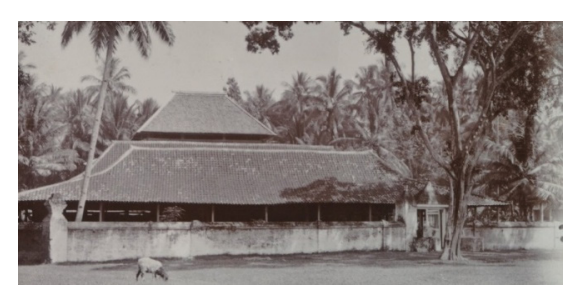
Figure 3 . Masjid Agung Sang Cipta Rasa in 1911

The Great Mosque has several nicknames, among others: Sang Cipta Rasa, and Serambi Pakungwati. The first oldest porch is located to the left of the mosque (south) called prapayaksa, while the front porch (east) is called scenery. Here is a picture of the porch of Masjid Agung Sang Cipta Rasa Cirebon.