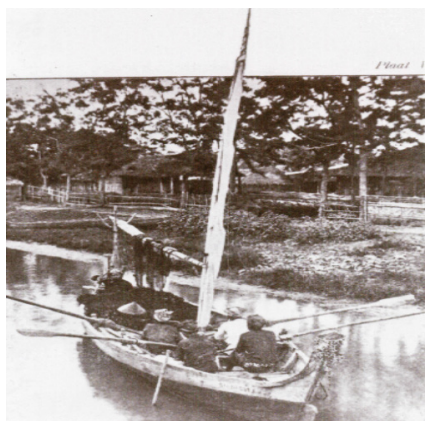
Figure 1. The sailboat (Bingkung) from Cirebon, West Java (5537/23, collection of KIT Jawa Barat, National Archives of the Republic of Indonesia).

a coastal area, became an important base in inter-island shipping and trading lines. Based on the arguments presented in the previous paragraph, that the coastline is the entrance to outside culture, the location of Cirebon as the border between West Java and Central Java makes Cirebon an important role for inter-island shipping and trading. According to Tome Pires (Pires, 2016), Cirebon has a good port, where there are 3 or 4 Jungs in that place. This place has large amounts of rice and other food ingredients. Here is a picture of a jung boat in Cirebon.