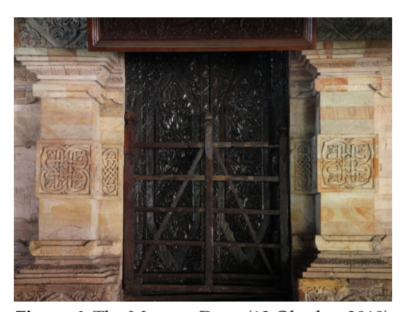
Figure 6. The Mosque Door (12 Oktober 2018)

The main door to the main room called narpati is located on the east wall, measuring 240 cm high and 124 cm wide. On this door, there are two doors, and on either side of the door, there are pilasters decorated with lotus motifs and tendrils on the top and bottom. Each measuring 1.95 m long and 53.5 cm wide, has a carved decoration of lilies, tendrils, and mirror frames. Carvings that are stacked on top of a door leaf are 1.24 m long, 40 cm wide, and in the middle of the carving arrangements are lined up with a tumpal decoration. The door near the east-west wall of Masjid Agung Sang Cipta Rasa has a height of 168 cm and a width of 68 cm, while the middle part has a height of 122 cm and a width of 55 cm.