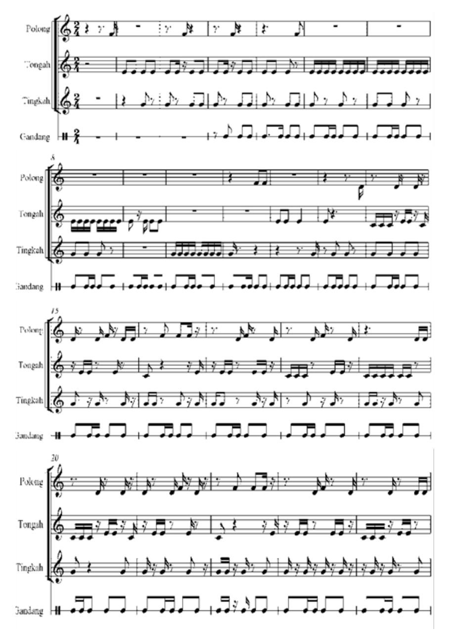
Figure 3. Notation of Mudiak Arau (Transcription by Nadya Fulzi 2011)

developing and interpreting the saluang dendang darek melody (providing melodic interpolations (sisik) or ornaments (bungo)) according to the version of talempong lagu dendang, so that the melody created is treated in a different way from the original version. The terms sisik and bungo describe the types of ornamentations that the talempong players create to produce a more attractive sound. For this reason, it is only possible for senior players with a high level of musicality to exchange roles with each other in the performance of ta-