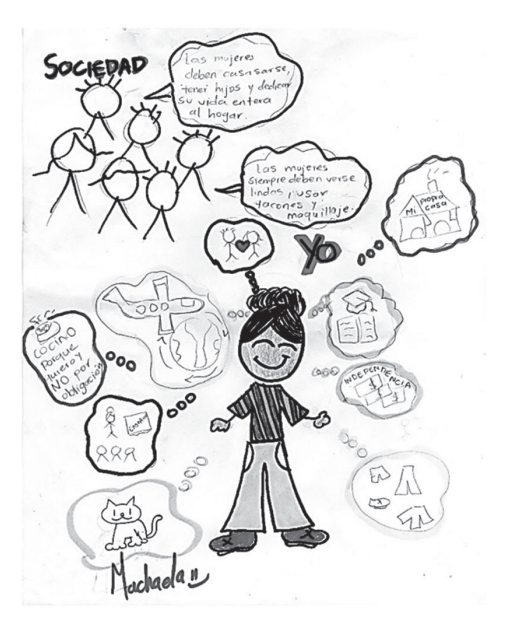
Figure 4. (Machaela, Third moment, Students' artifacts).

Thus, when contrasting Machaela's words with the artwork (Figure 4) she decided to draw, we could analyze how those words were put into action when describing those new generation plans for her life.