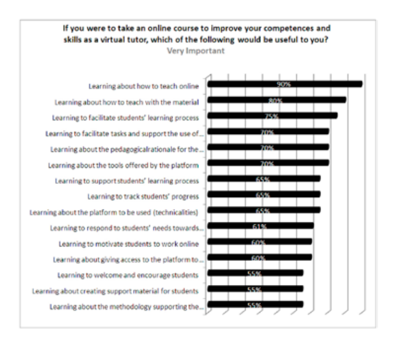
Figure 3. "Very Important" competencies to learn in an online training course

The questionnaire and results presented yielded interesting information to inform the needs analysis. Respondents considered a variety of tutor roles as important including tutor, facilitator, support, motivator. Consequently, teacher-training courses should include some awareness on the variety of roles and way they shift in the online learning environment. Based on the results, pedagogical activities not related to language learning, such as giving feedback, creating video tutorials and checking progress, can also be included as support materials for novice online tutors. Finally, managerial activities, such as learning about creating support material (e.g. screen casts) for students, creating announcements and learning to motivate students to work online will also need to be included in teacher training courses. Other important competencies to include are learning to facilitate students' learning processes and learning to facilitate tasks and the use of learning materials. Finally, the responses confirmed the need for accompanying teachers not only in the pedagogical roles online tutors exert, but also on the managerial, technical and social ones suggested by Berge (1995.)