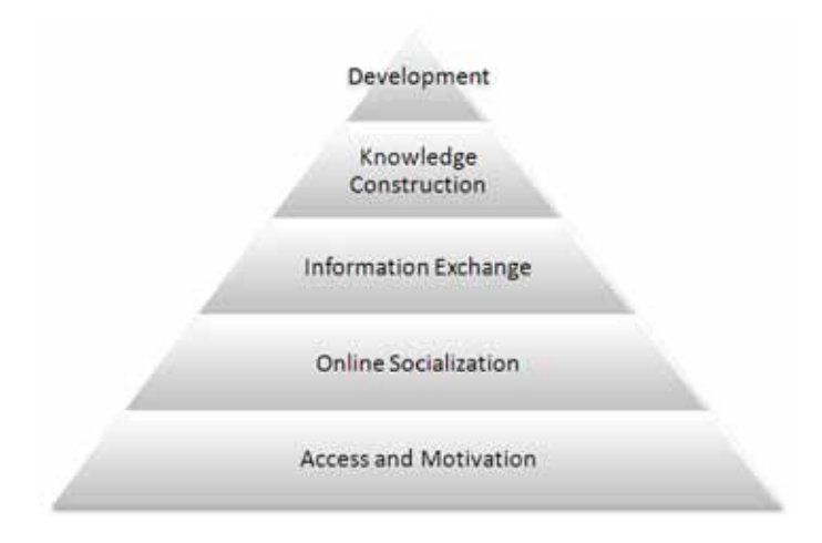
Figure 1. Salmon's five-stage e-moderating model (2002, p. 29)

Salmon (2002) argues that "successful online learning depends on teachers and trainers acquiring new competencies, on their becoming aware of its potential and on their inspiring the learners, rather than on mastering the technology" (p. vii). Salmon's five-stage model for e-moderation describes how the online tutor is involved in different activities that shape the learning experience. The model suggests that people "learn about the use of the computer networking along with learning about the topic, and with and through other people" (p. 28).