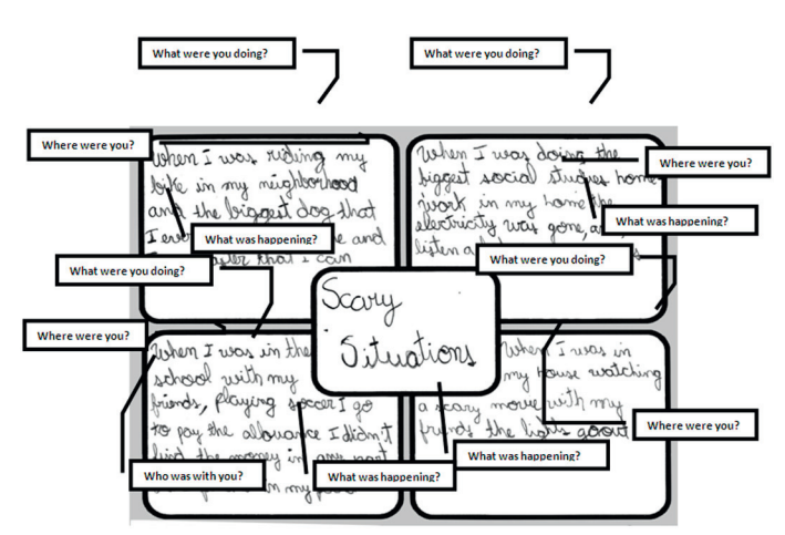
Figure 3. Four-box organizer

Translating. One example of the What-Why-How strategy was an activity in which students were asked to talk about scary situations using simple past and past continuous. They were introduced to different scenarios and a model of how to use a four box graphic organizer. Then, they had to complete the four boxes decribing their situations answering information questions.