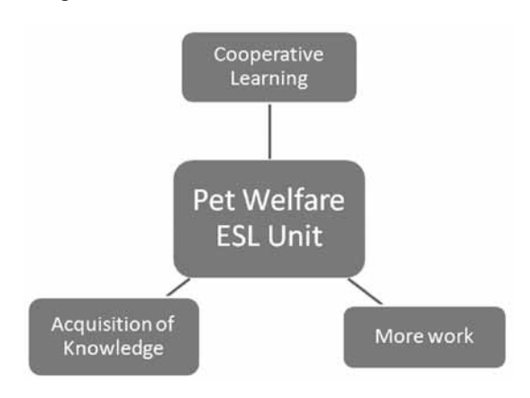
Figure 3. Participants' perceptions of collaborative service learning project

Participants wrote their process reflective essays as they were working in groups designing their ESL units on pet welfare. There were three themes that emerged from participants' reflections, which are depicted in Figure 3.