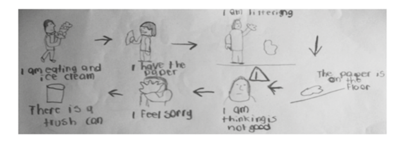
Figure 2. Child's drawing to describe his action and to evaluate his behavior.

He used language that evaluates his behavior with expressions including, "I am littering," "It is not good," "I feel sorry," and "I am thinking is not good." Drawing and lexical choices conveyed the message and enabled the learner to communicate and share his feelings. The category of judgment is associated with the actions that constitute evaluating behaviors related to environmental care.