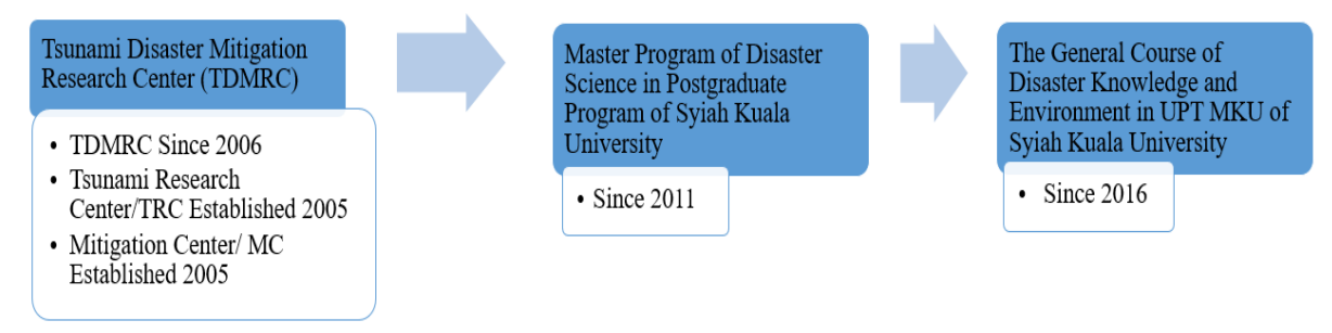
Figure 3. The Journey of Syiah Kuala University Toward Disaster Preparedness Campus

Based on the results, three disaster-curriculum implementation steps were carried out by Syiah Kuala University to enhance preparedness among Aceh community members, especially the students. These steps included, (1) The establishment of the Tsunami Disaster Mitigation Research Center (TDMRC) in 2006, (2) The development of the Master of Disaster Science within Syiah Kuala University's Postgraduate Program in 2011, and (3) The founding of the General Course of Disaster and Environment Knowledge in 2016. Figure 3 presents the journey of Syiah Kuala University toward a disaster preparedness campus in Indonesia.