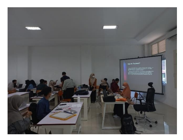
Figure 2. The teaching of general disaster and environmental knowledge courses

After these processes, the analysis of data used the Delphi method, which is a systematic technique for obtaining opinions from a group of experts. This is often carried out through a series of structured questionnaires, where a feedback mechanism is observed via a round of questions held while maintaining the anonymity of the participant's responses. The technique was also originally developed as an interactive forecasting method, which depended on various experts (Foley, 1972; Linstone, 1975). In this method, interviews and questionnaires were addressed to the experts and informants, which appropriately determined the study's information details to obtain the best and perfect answers. For more clarity, Fig. 1 shows the experimental data collection process.