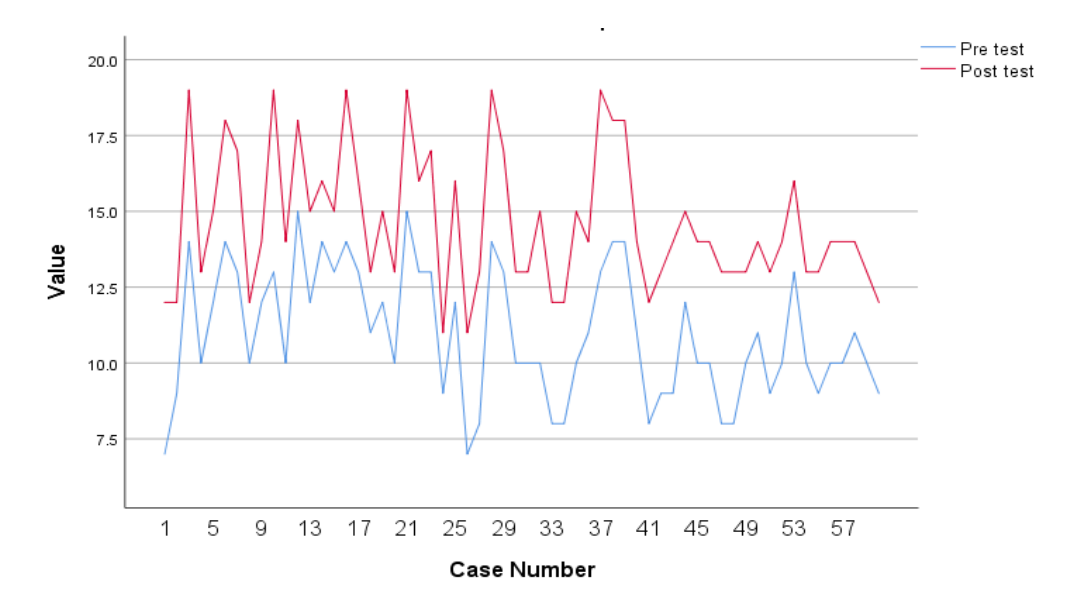
Figure 4. Wetlands ecological literacy in the test result