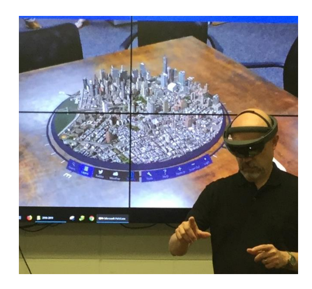
Figure 4. The video wall combined with augmented reality goggles allows multiple students in the class to see what the person wearing the Microsoft HoloLens goggles is experiencing