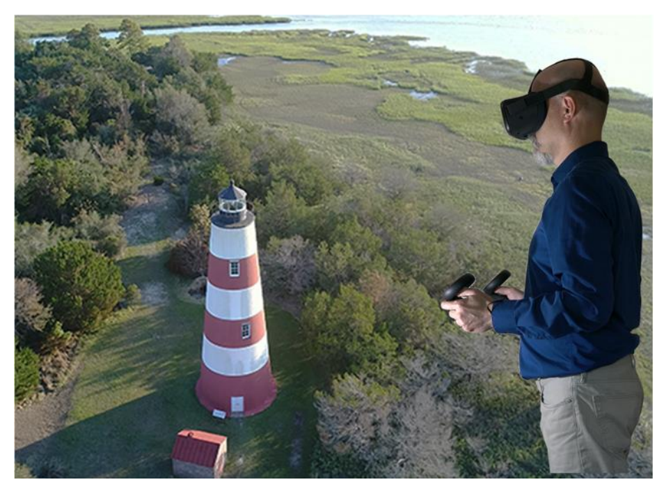
Figure 2. Virtual reality headsets allow students access to remote environments, immersive experiences in a variety of landscapes and exposure to cultural resources

The augmented reality sandbox was designed and built in-house by UGA-CGR students and faculty. The system consists of two Xbox Kinect sensors configured to interact with the topography of the sand contained within a wooden box supported on a frame at waist height. A downward-pointing projector is connected to a laptop such that the display of geospatial data and model output can be projected onto the surface of the sand. Intended to be interactive and participatory, users gather around the sandbox and are encouraged to move the sand with their hands to build "mountains and valleys" that can even recreate the topography of real locations. See Petrasova et al. (2015), for a complete discussion of tangible modeling and software/hardware requirements for constructing an augmented reality sandbox. The UGA-CGR sandbox was designed to be transportable with casters and a telescopic structure such that the frame can be lowered to fit through doorways and wheeled to classrooms, laboratories, other buildings or even public spaces. In this way, exposure to the augmented reality technology can be maximized and to-date the sandbox and mobile goggles have been used in 55 courses and 13 public events for over 6,000 individual interactions.