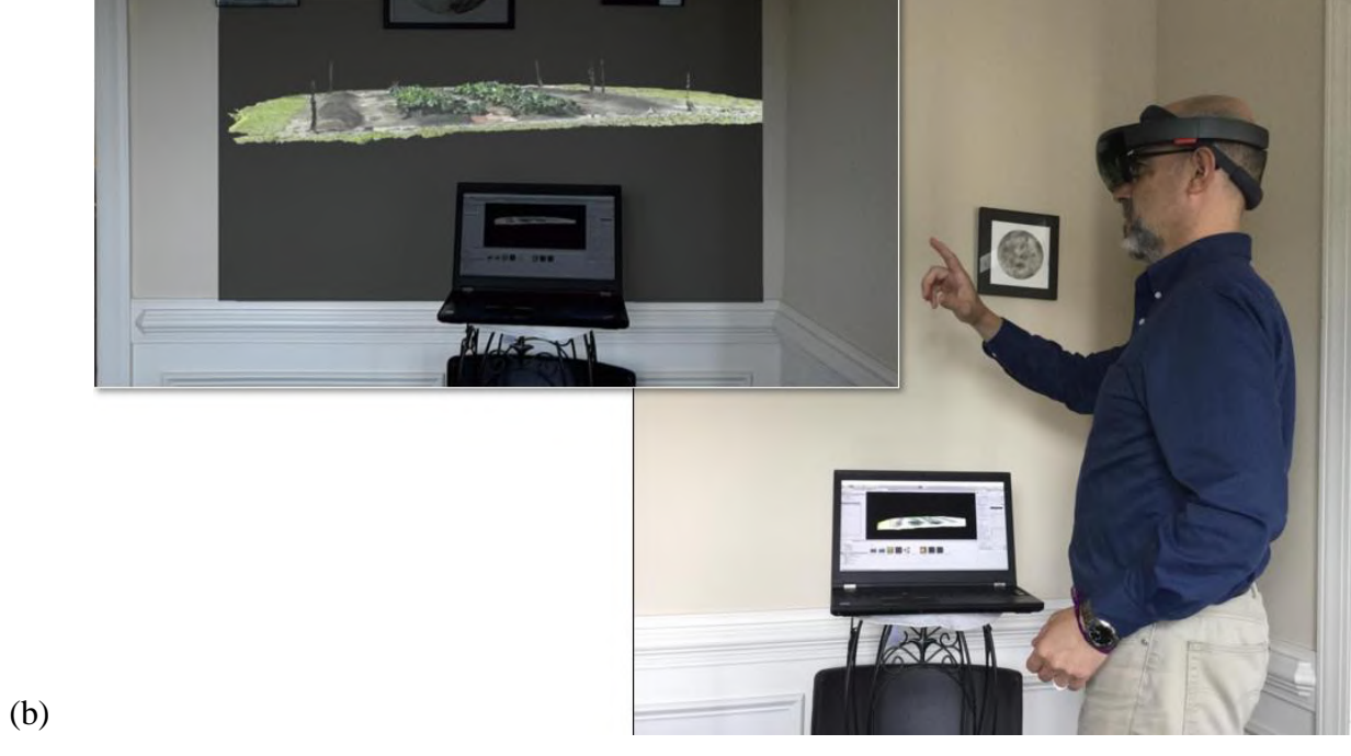
Figure 5. (a) 3D crop models produced by photogrammetry and UAS images of small gardens can be converted to augmented reality displays (b) for public viewing

Emerging developments in virtual, augmented and mixed reality and increased accessibility to the hardware and software required to access their implementations have led to renewed interest and new possibilities for uses in research, education and outreach. Çöltekin et