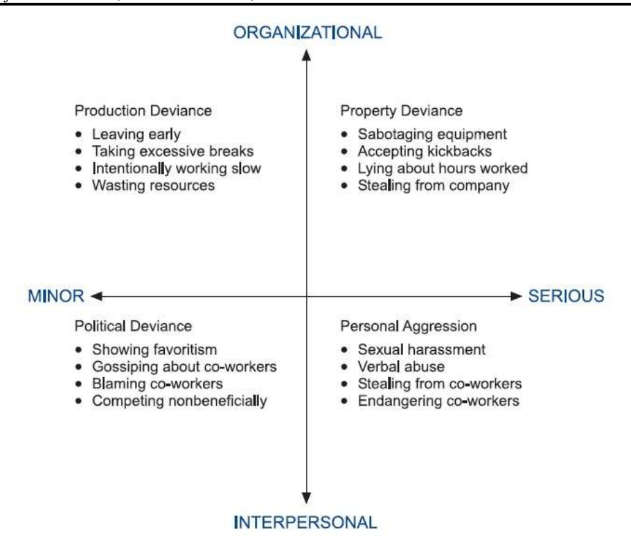
Figure 1: Dimensions of Workplace Deviance Source: Robinson and Bennett (1995)

Figure 1 shows that organizational deviance includes those actions that are against the organization, for instance, sabotaging equipment's and/or wasting resources, however, interpersonal deviance includes such behaviors that cause harm to employees, for instance, verbal harassment and/or assault (Robinson & Bennett, 1995).