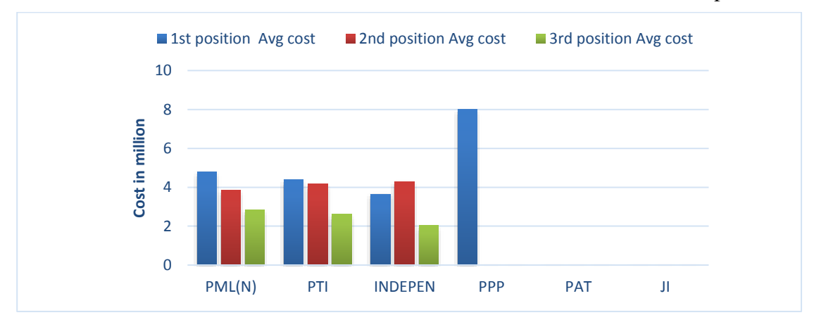
Figure 6.3: Average campaigning cost of candidates with respect to position across candidates affiliated with various political parties

One can ask why candidates of PTI consume more than the candidates of PML (N). A possible answer is that the expenditure from the candidates of PTI is high as they have to compete with candidates from the ruling party of PML (N). Peer pressure from competing candidates could also force them for spending high on the election campaign. The closer the competition, the closer is likely to be the expenditure. This conjecture is also supported by Figure 6.3 which depicts the expenditure of the first three position holders across PML (N), PTI and independent. The figure indicates that on average the expenditure on campaigning by position holder is higher and close to the corresponding candidates on the same position. In the diagram, PPP shows a single bar as there were no candidates in the rank of second and third position holder from this party. Similar is the case of JI and PAT, whose candidates were not on the list of the first three positions.