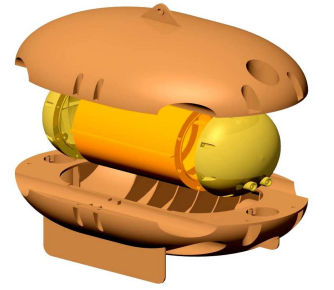
Fig.2. TOYROV rendering [6]

With regard to submarine constructions, the applications are multiple, ranging from the periscope fairings to the domes of rocket launching capsules on the battle submersibles. We can also mention unmanned devices whose structure and buoyancy elements are made of composite materials: the thick walls of high pressure resistant cells are made of fibrous composite materials and the buoyancy elements are made of syntactic foam. The Naval Architecture Faculty of Galați participated in the reserach grant TOYROV 12-116/2008 during which there were developed and studied 25 constructive solutions for an autonomous submarine vehicle (Figure 2)