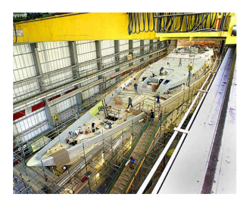
Fig.5. Mirabella V