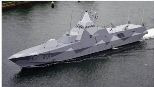
Fig.1. Visby Class Swedish Corvette

tensive use of composite materials can be seen in the Swedish Royal Navy's Visby class, measuring 72 meters in length and 10,4 meters in width (Figure 1). This ship is the largest military ship built using composite materials (carbon fiber in the sandwich structure with vinyl esther resin matrix). If Visby was to be made of traditional metallic materials, the total mass would have been almost double (1,200 tons), making composite material largely responsible for the performance of the corvette.