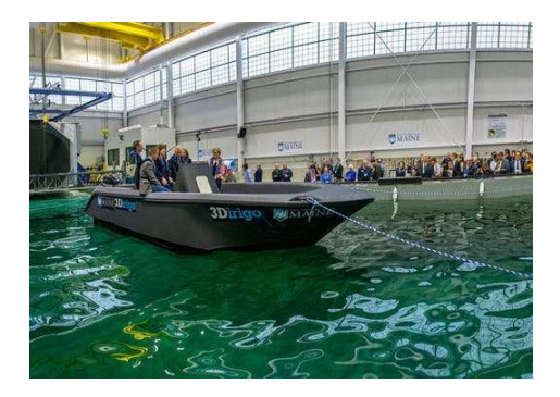
Fig.6. 3d printed composite boat [9]

One of the advantages of composite materials is that certain features specifically sought by the designer can be modified by relatively easy-to-operate changes in the way the final laminate is obtained.