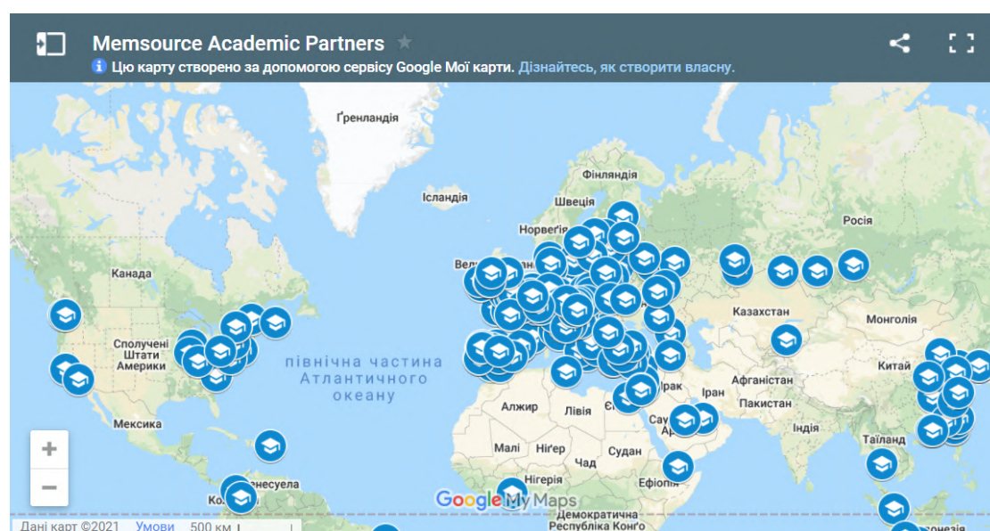
Figure 1: Geography of university use of the Memsorce cloud system.

An equally important argument in favour of using Memsorce as the base element of a cloud-based system is its widespread use and study in the world's leading universities training translators (figure 1).